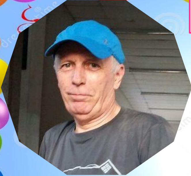
24 th Pukka Sahib