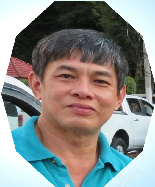
28 th Silent Man