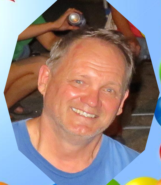
29 th Pimp