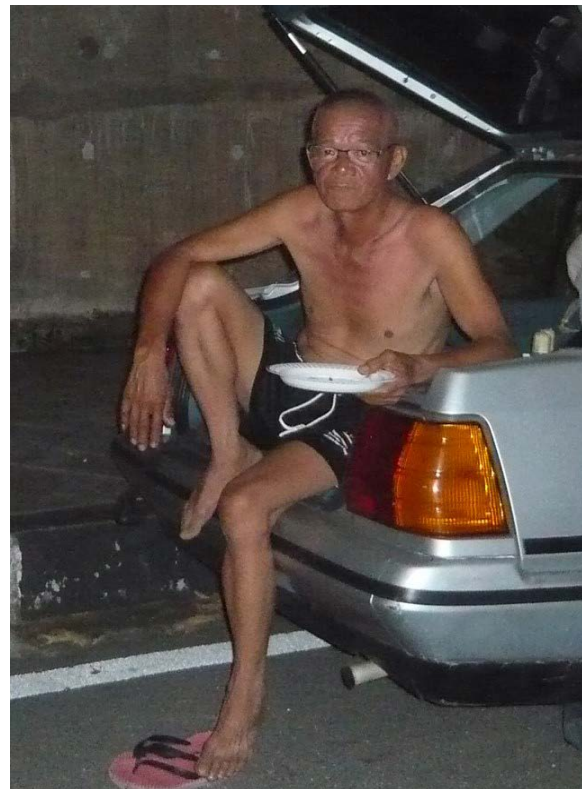
29, Take Care