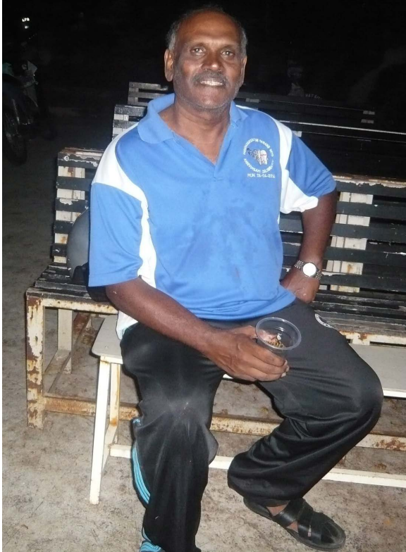
26, Snap Cop

Sorry guys, I forgot to put in your birthdays, so a special page for you, happy birthday!