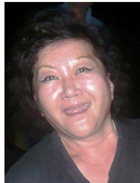
23, Beauty Queen