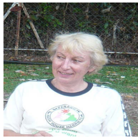
18, Bibi Tulips