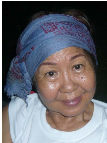
7, Mem Sahib