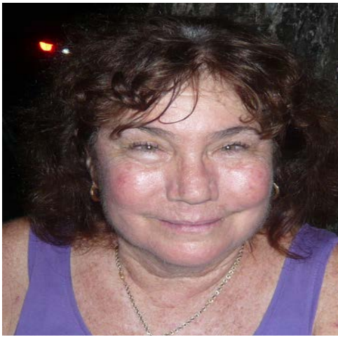
3, Kiss Me