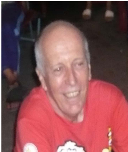
24, Pukka Sahib