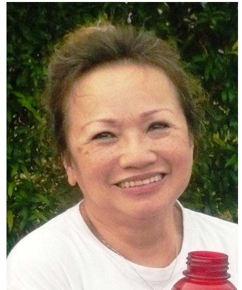
24, Miss Bollywood