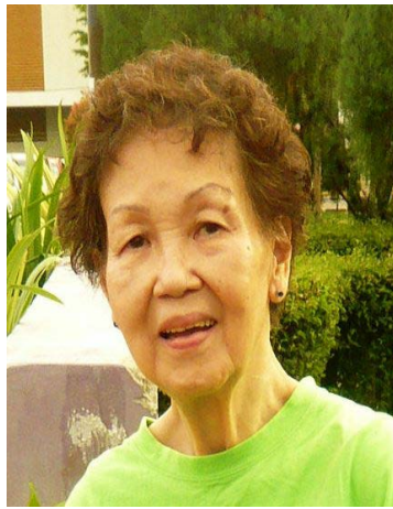
8, Molly, Huge