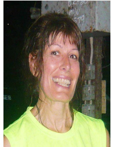
12, Frozen Pussy