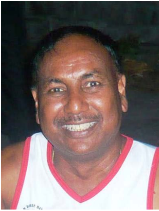
15, Good Year