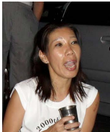
27, Hot Lips