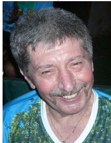
17, Fancy Pants