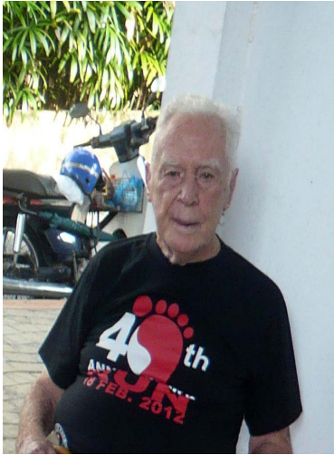
6, Snow White