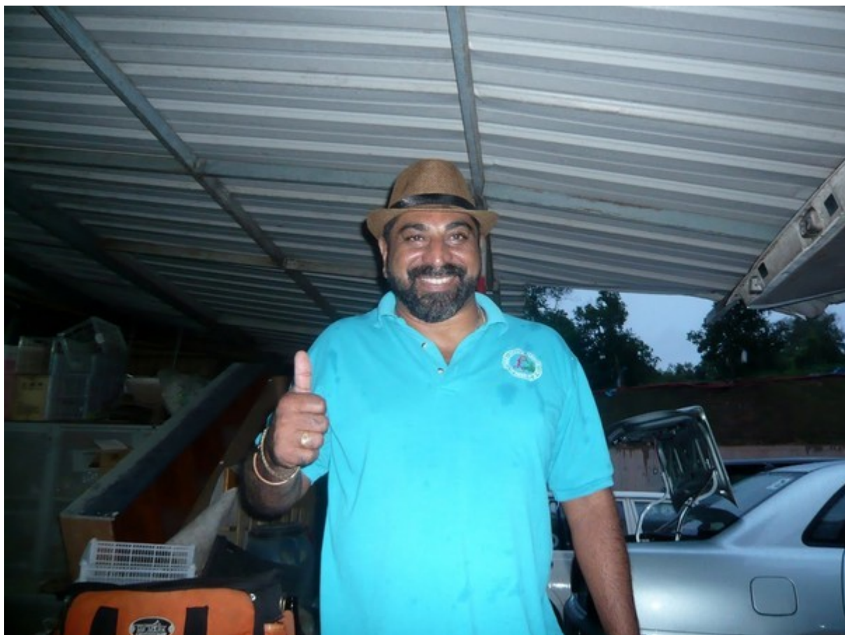
The Hare of the Day