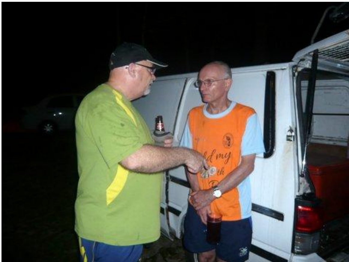
The rather thick and the thin of it all!!