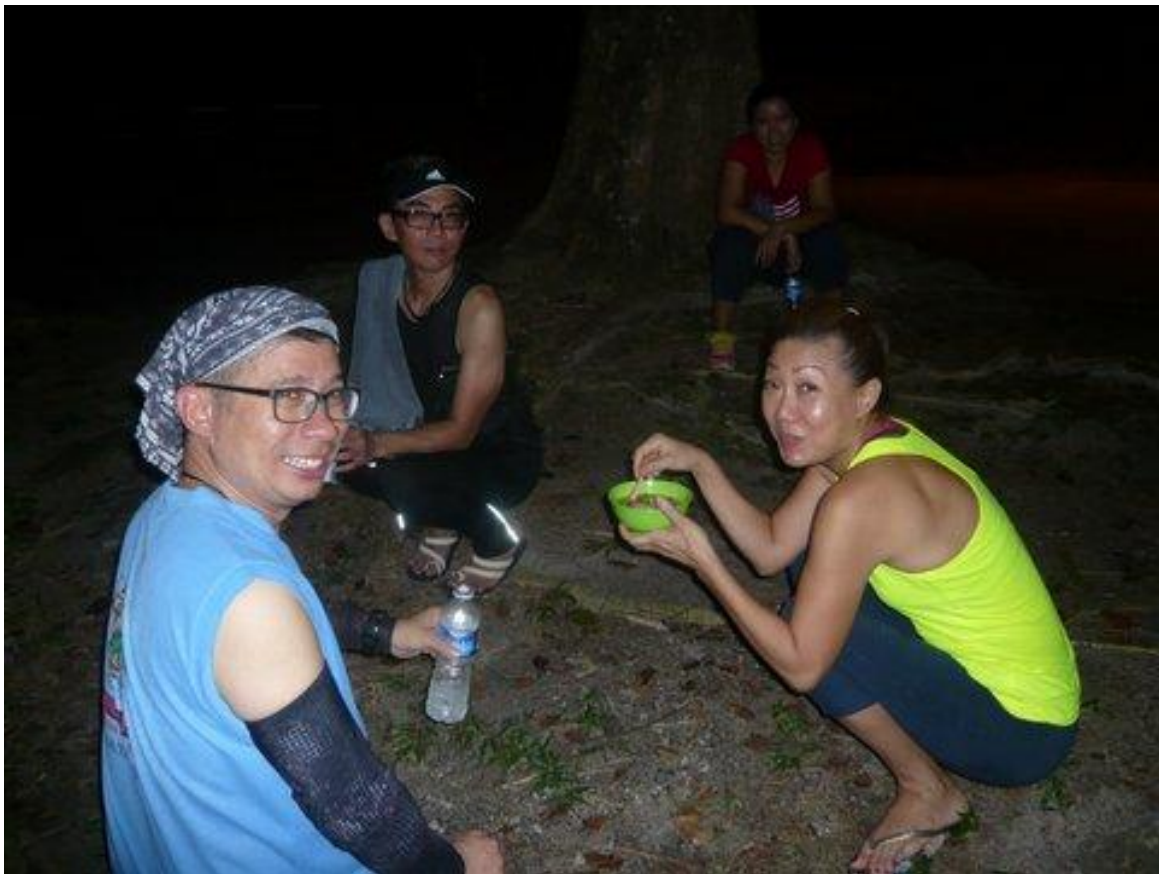
Wish I could do that!!