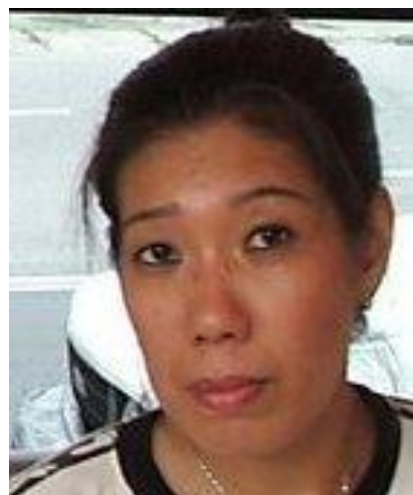
Hot Lips 27 th