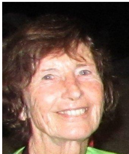
Tiny 18 th