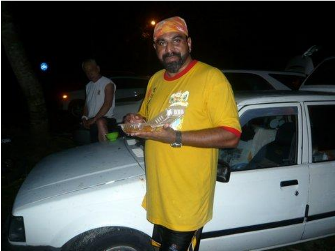
Shame Smiling Horse missed the Diwali run!