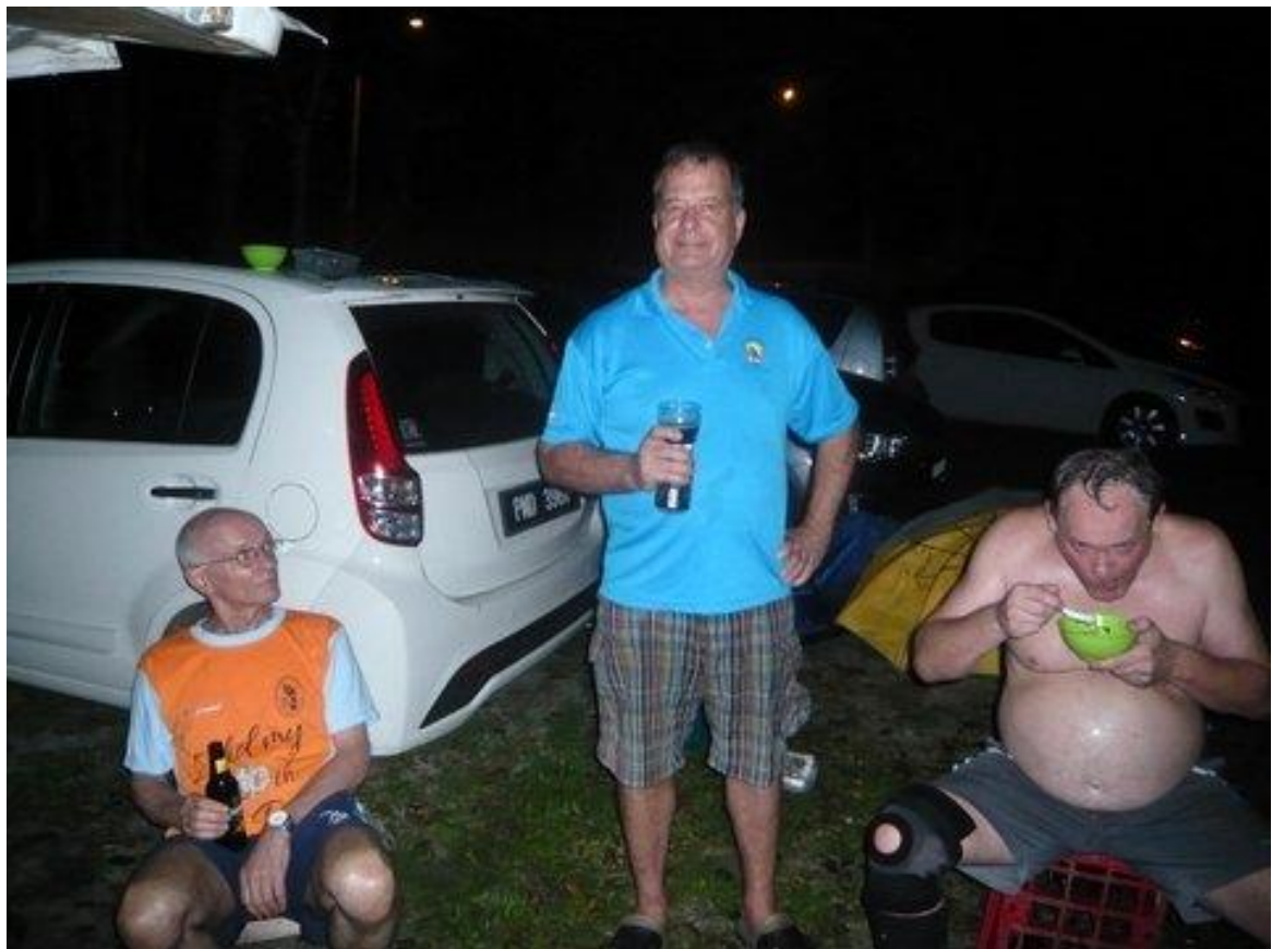
Who's the odd one out here??