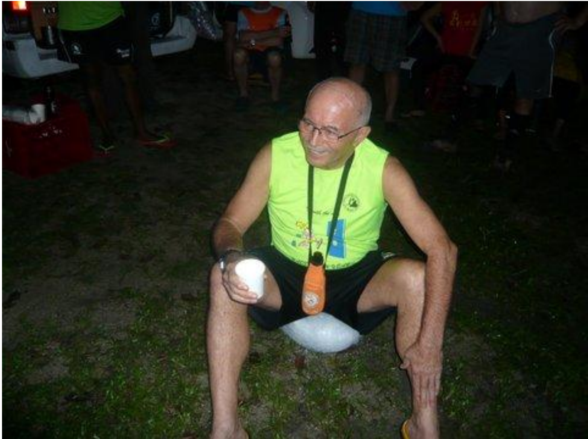
Old and slow...Bullshit he still comes out first!!