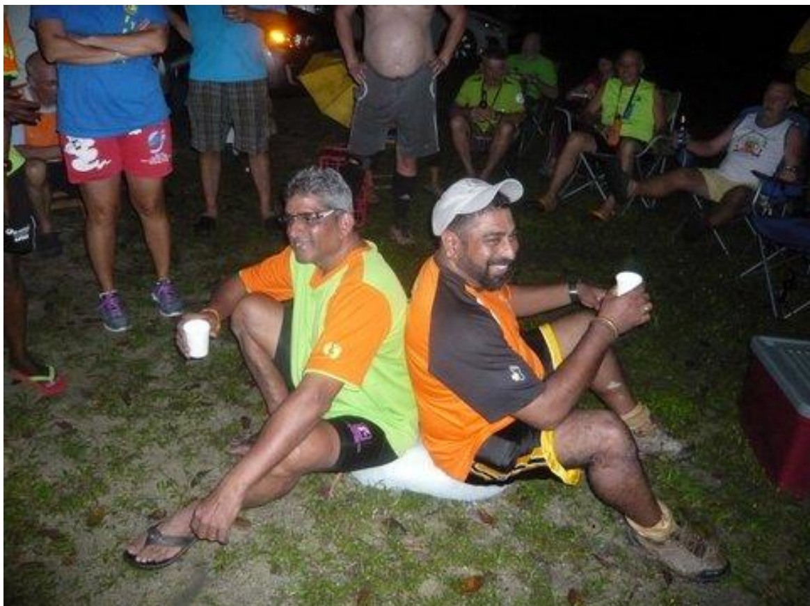
Thank you but why did you miss the Diwali Run??