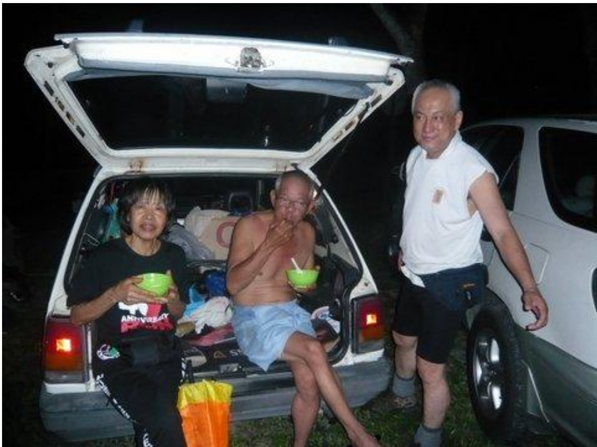
The Chai Boey is GOOD!!