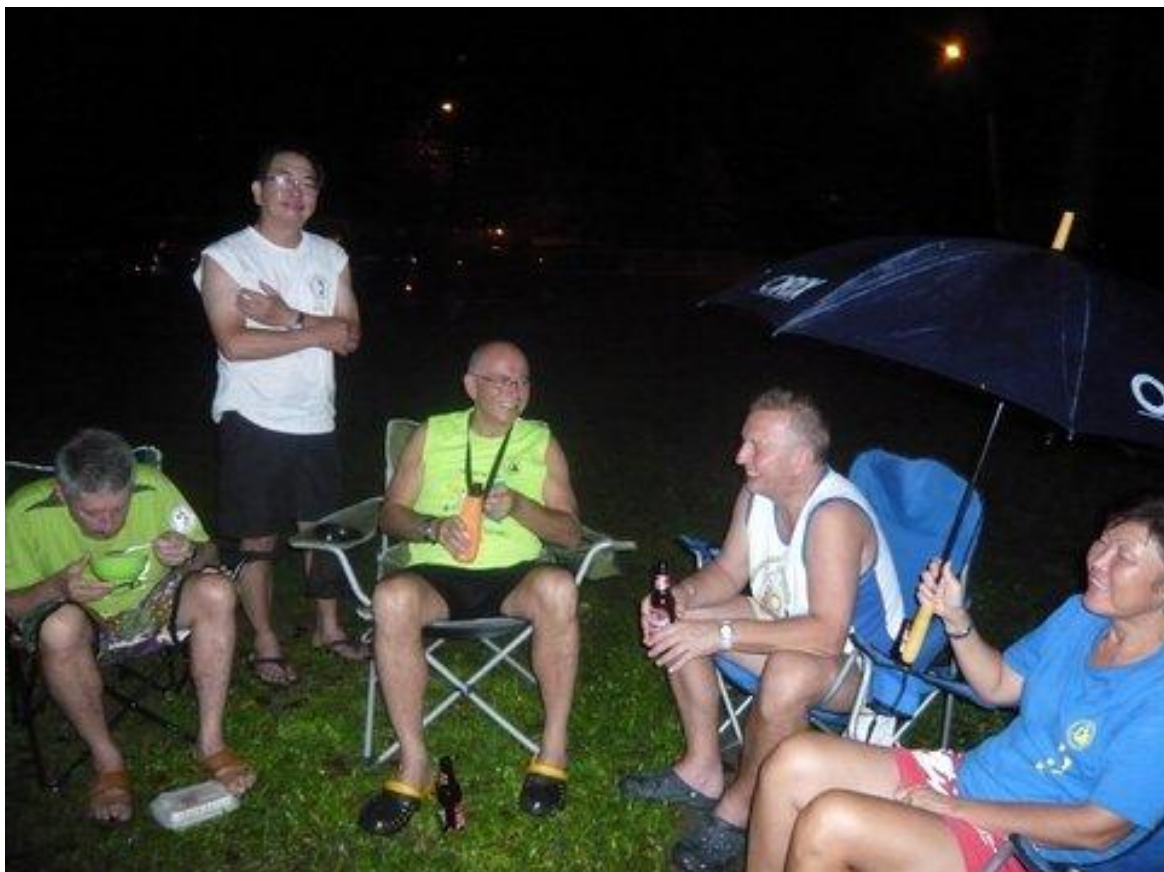
Laughing in the rain