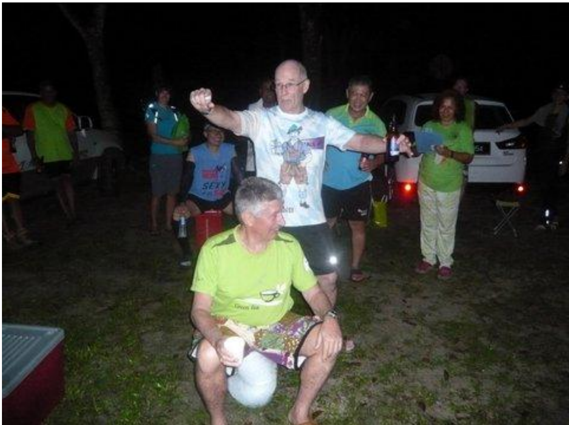
And the 'snake' was this long!!