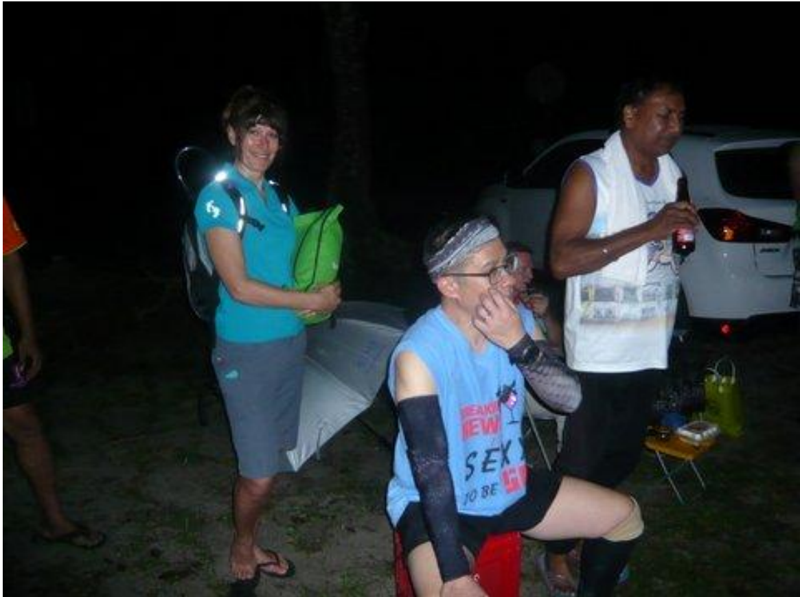
Our two newest members and an old fart!!