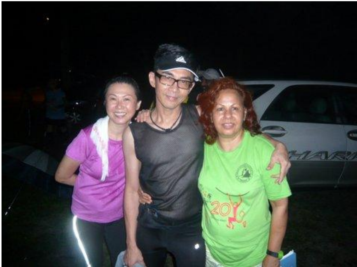
A thorn between two roses