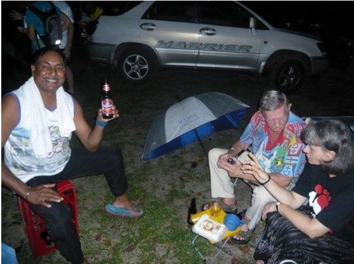
What am I?? The car says it all!!!