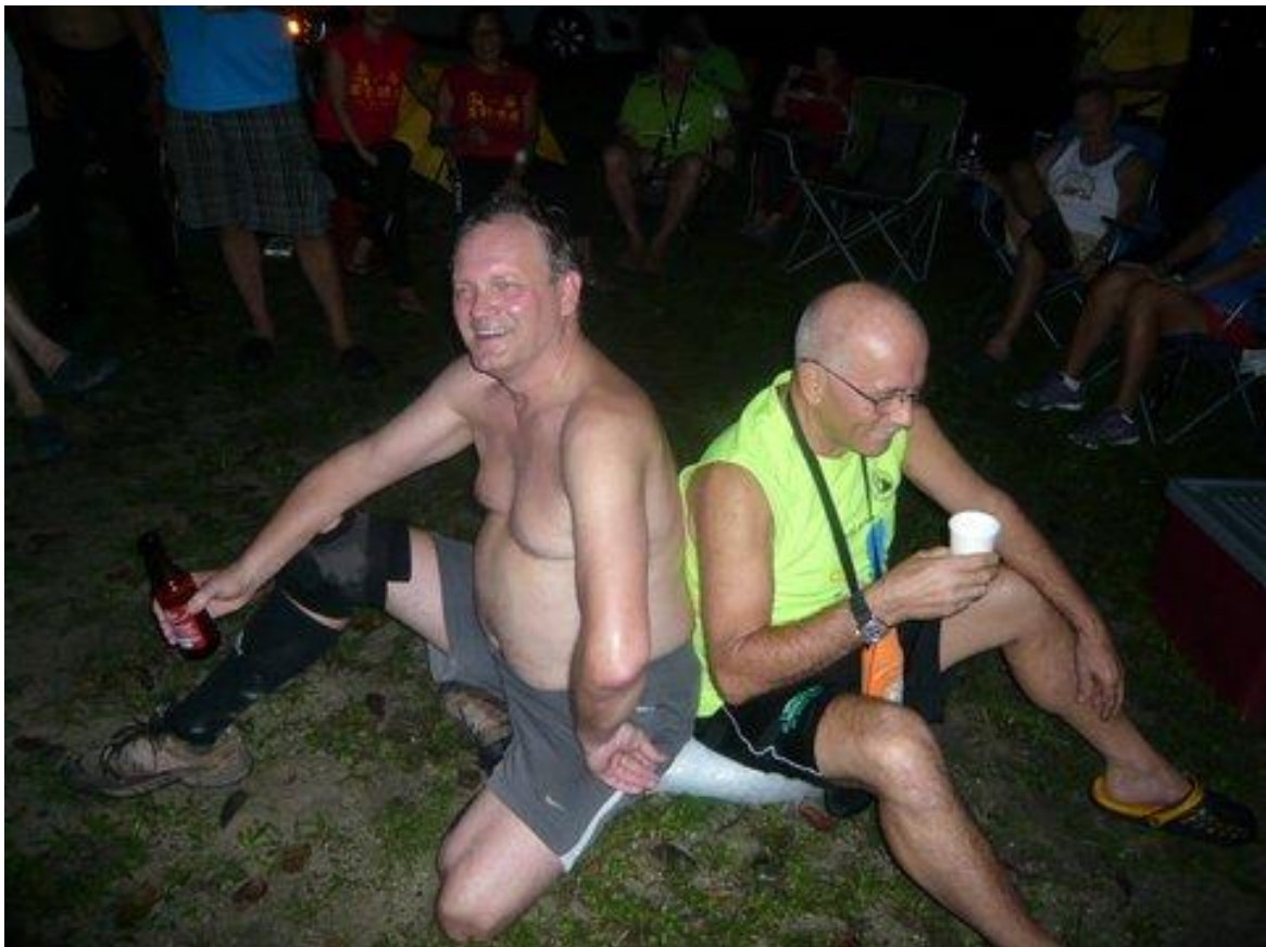
Two sickies on a sick bag