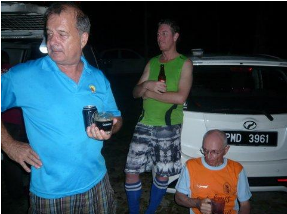
I wonder who these three are giving the eye to!