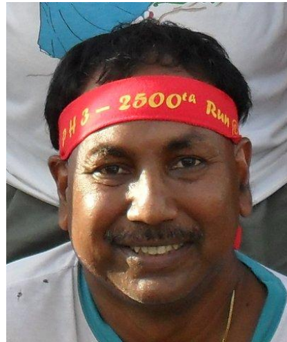
Goodyear 15 th