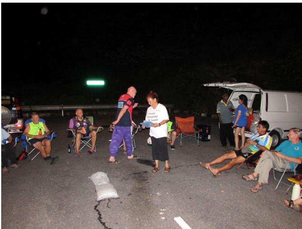
Huge, exit stage right . . .