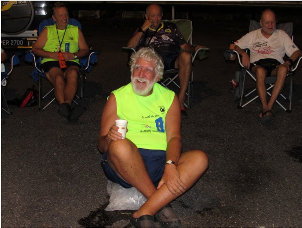
Chef, and Hare