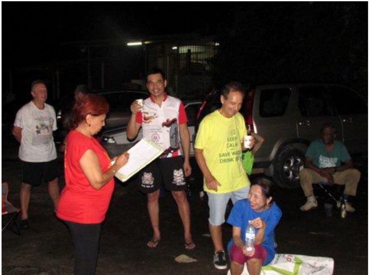
Welcome, Welcome, Welcome