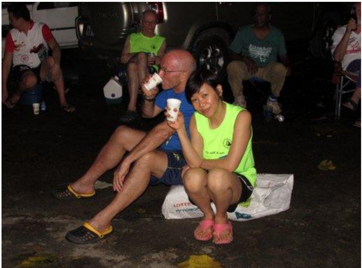
The Early Birds