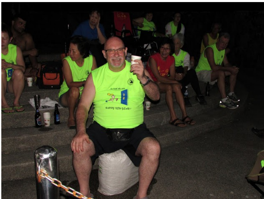
Akz Hole enchaîné