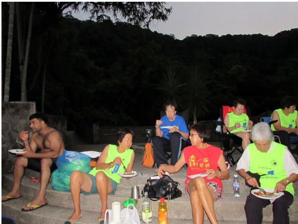
Dinner by twilight