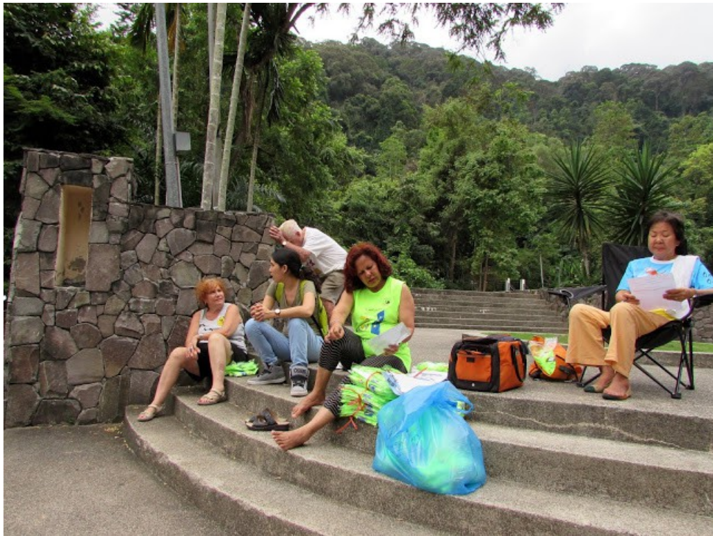
Note head banger in background