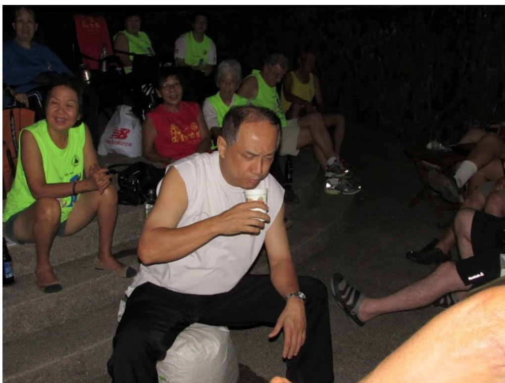
What's with this beer?