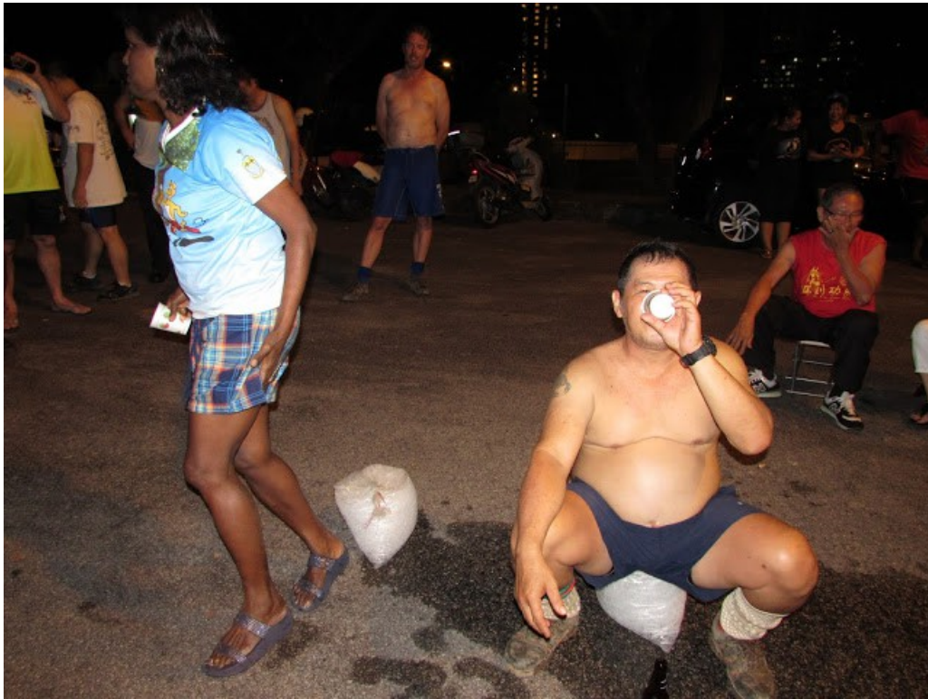
Ice water coming, I'm off