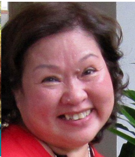
Datin 9 th