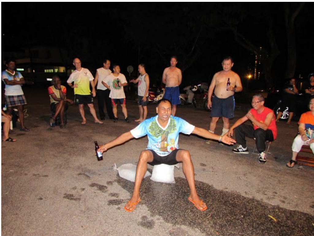
Free flow back at Bee Gallery