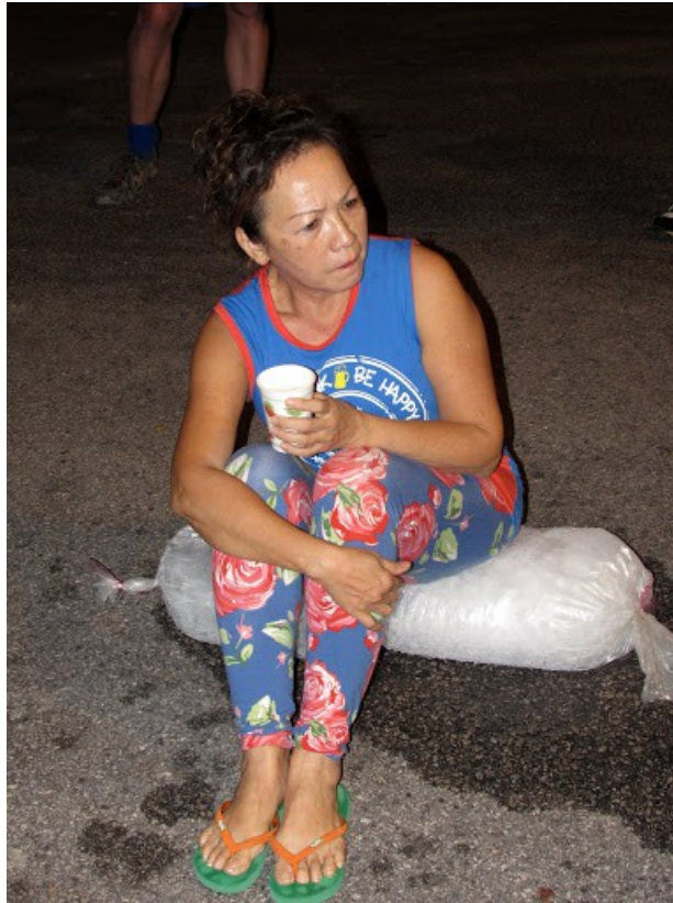
The lady is for U-turning