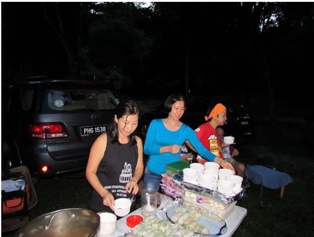
The dinner ladies