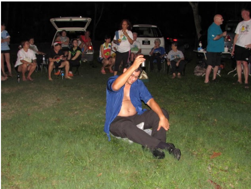
Baipass shows cleavage