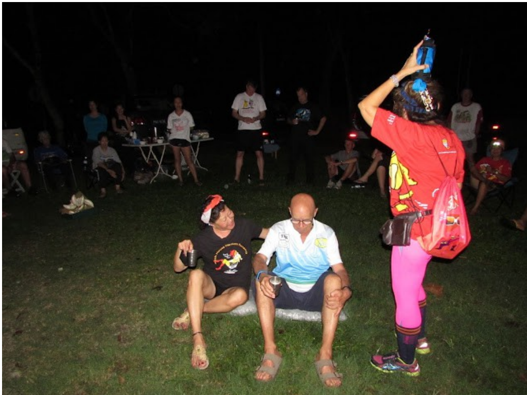
Why so shy lah?