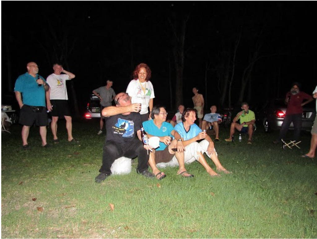
The Dinner Club (President hides his face in shame)