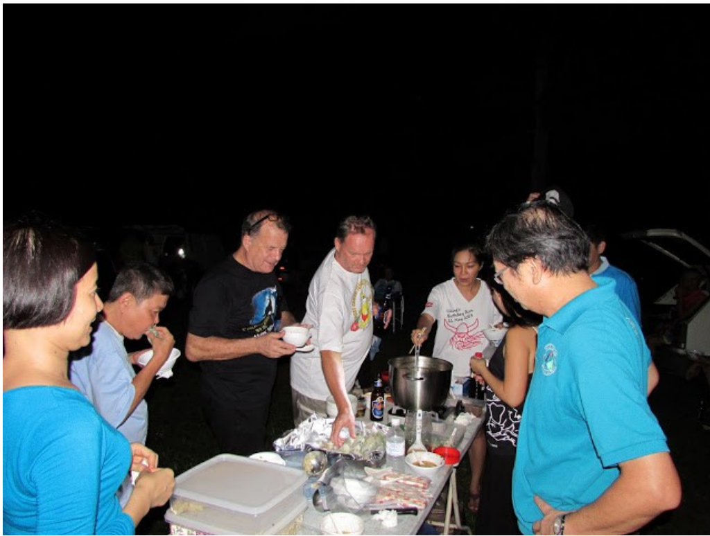
Dinner Club President inspects the food