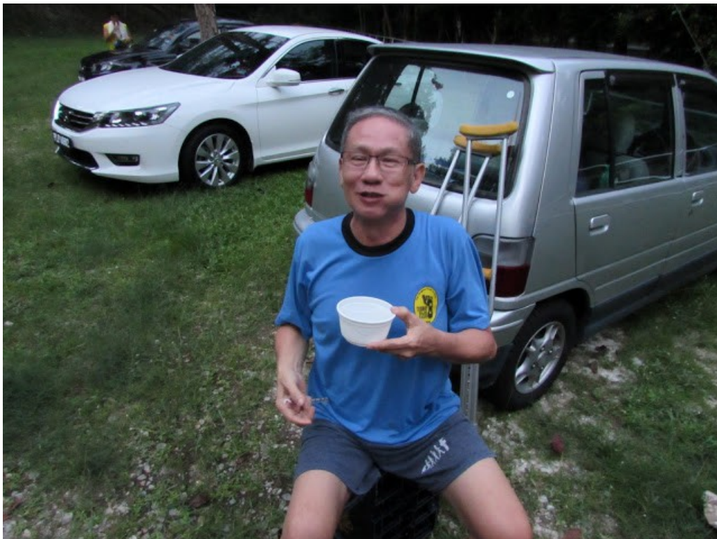
Tody, no excuse, next run . . .