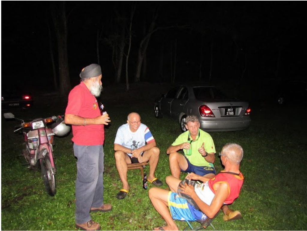
Take Care bends over backwards for Mini-Sausage