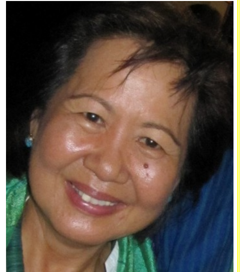
Cheng 7 th