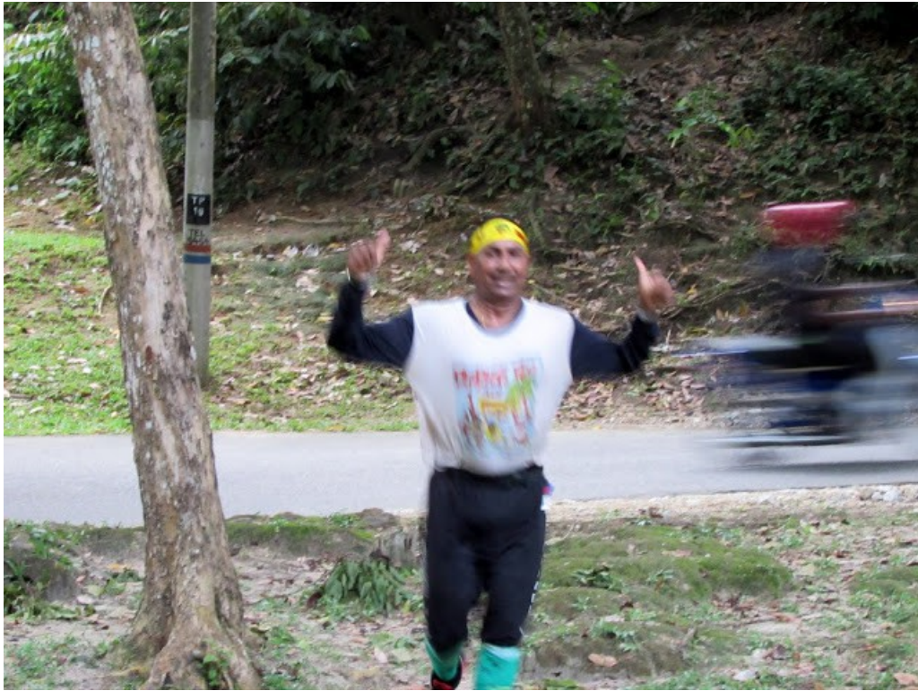
Faster than a speeding motorcycle