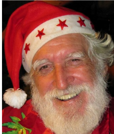
Mark 4 th