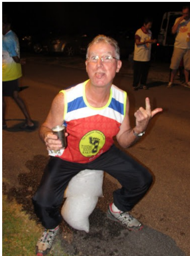
I'm sooo pleased to be on ice