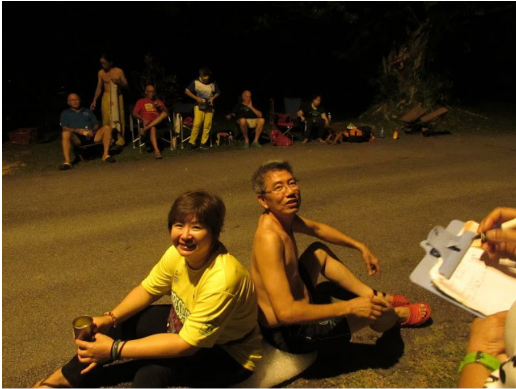
Welcome back guests