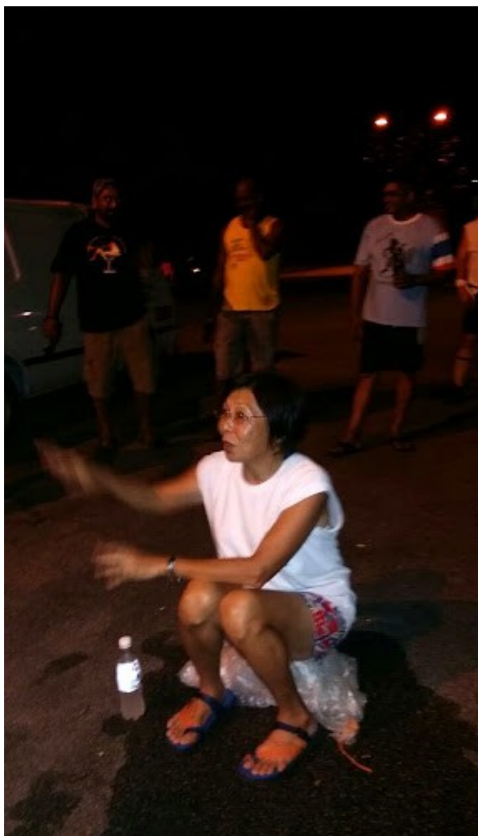
Bunny (almost) on ice