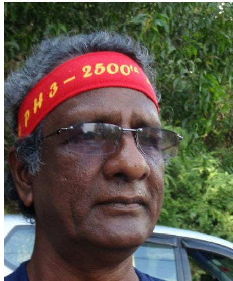
Kali 22 nd