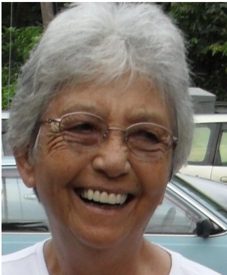
Rose 22 nd