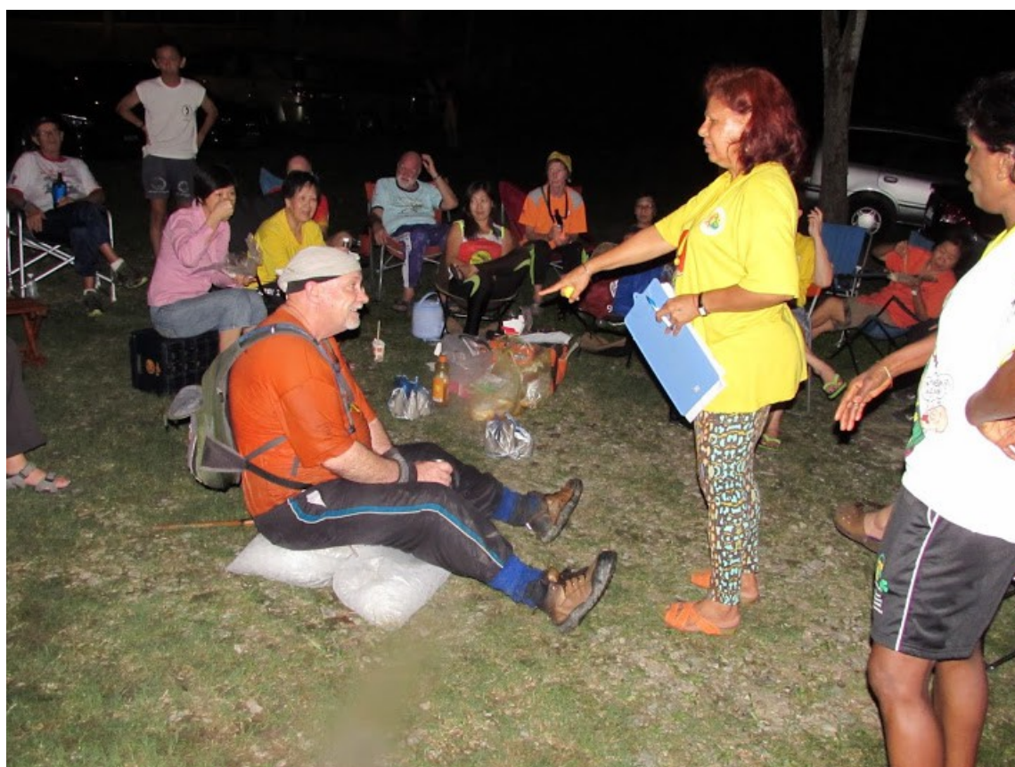
Next time just do as I say