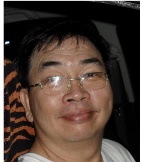
Mark 26 th