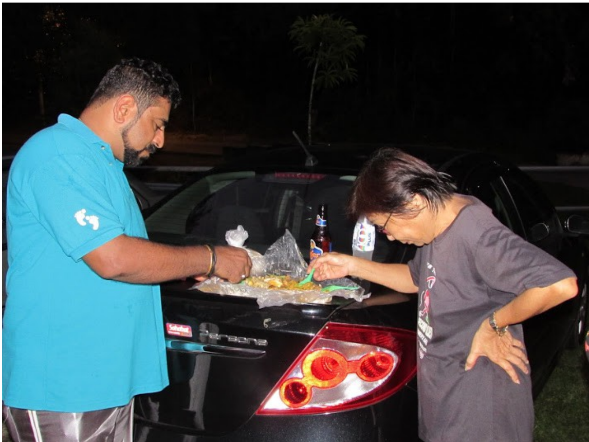
So why does your food taste better than mine?