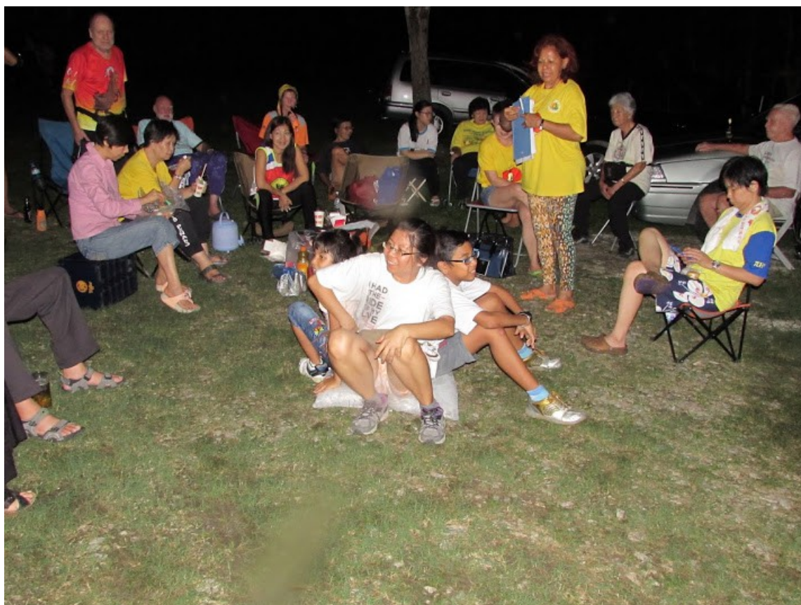
The Goodyear brood on ice