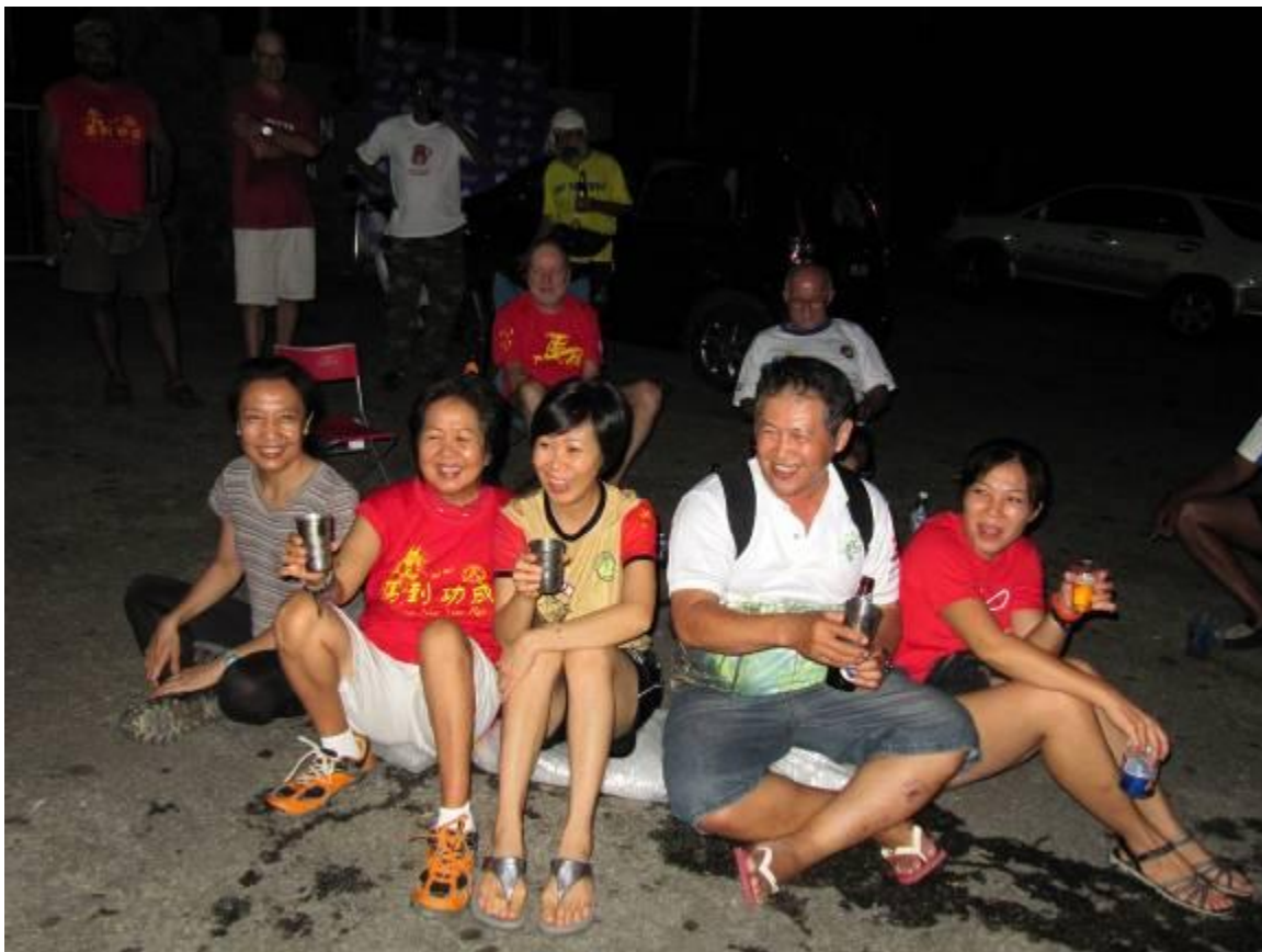
The next charge was for the Chinese to wish them Happy New Year and Health and Prosperity for the Year of the Goat