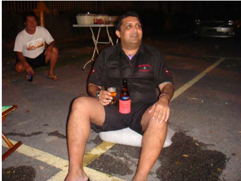
Guest Welcomed- Hitman from Germany