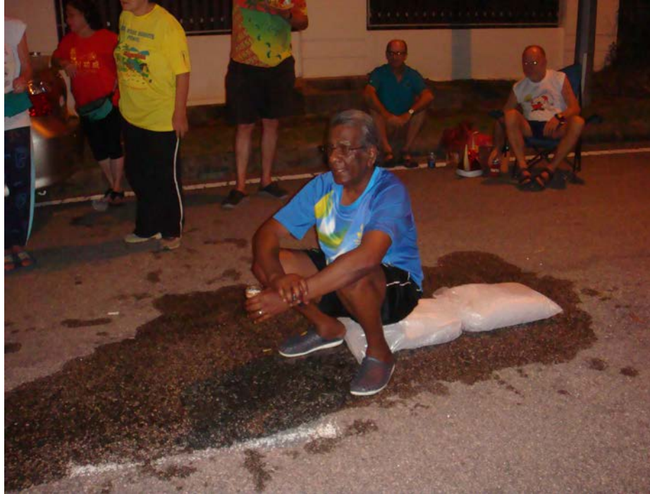
Black Jerman for having the Biggest Plate (Big banana leaf plate) for tonight's dinner