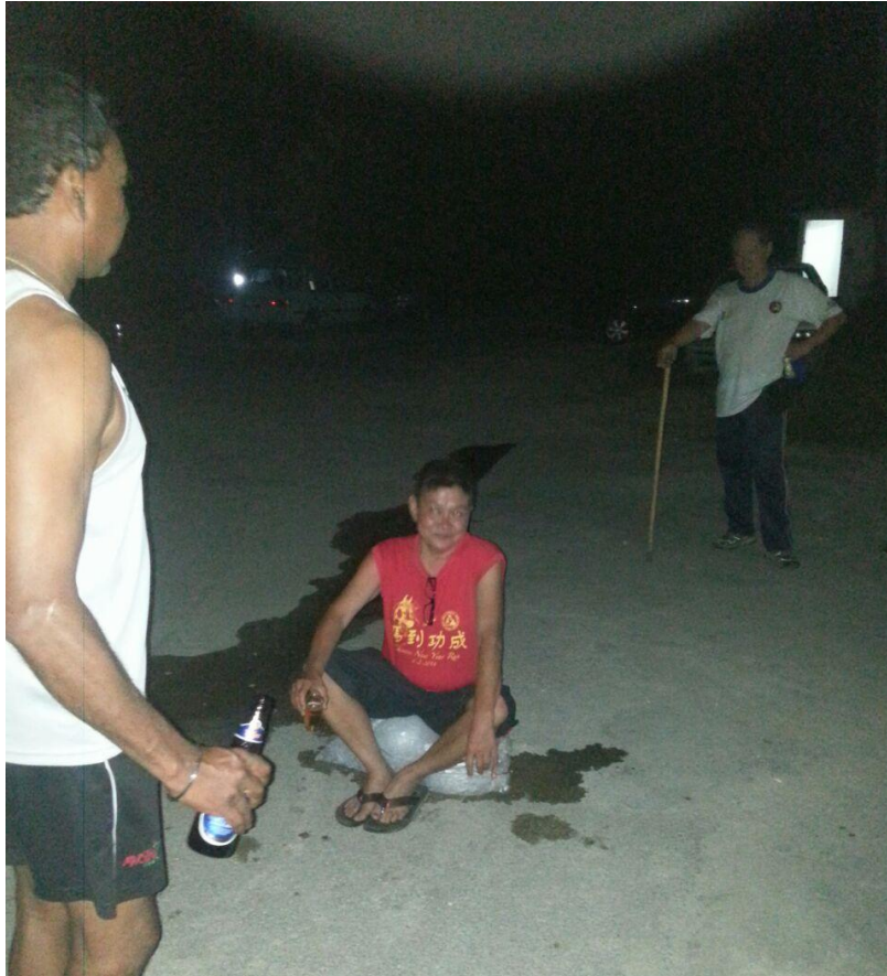
OUR FRAGILE GM BEING ICED BY GOODYEAR FOR NO LONGER RUNNING AS SHE BREAKS TOO MANY BONES!