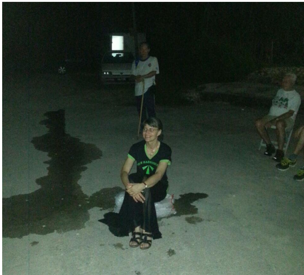
POLE DANCER WAS THANKED FOR FANTASTIC HOME COOKED FOOD AND A GOOD RUN.