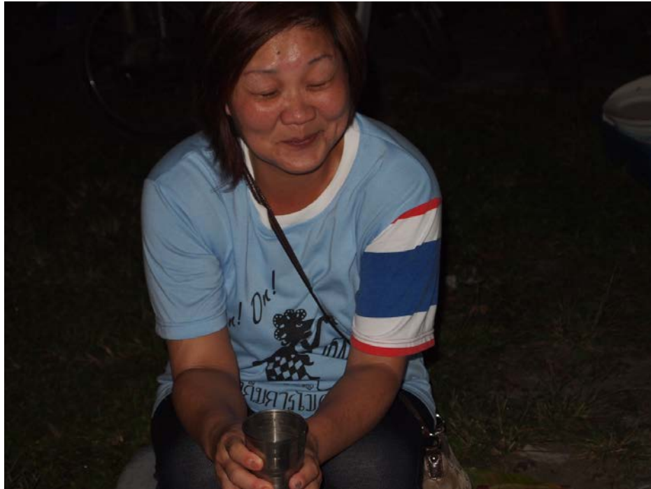
Tiny iced Hairdo for Time to grease the Amah....time