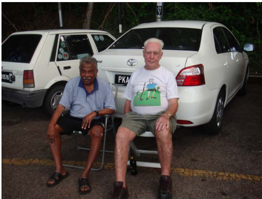
Most senior hashers