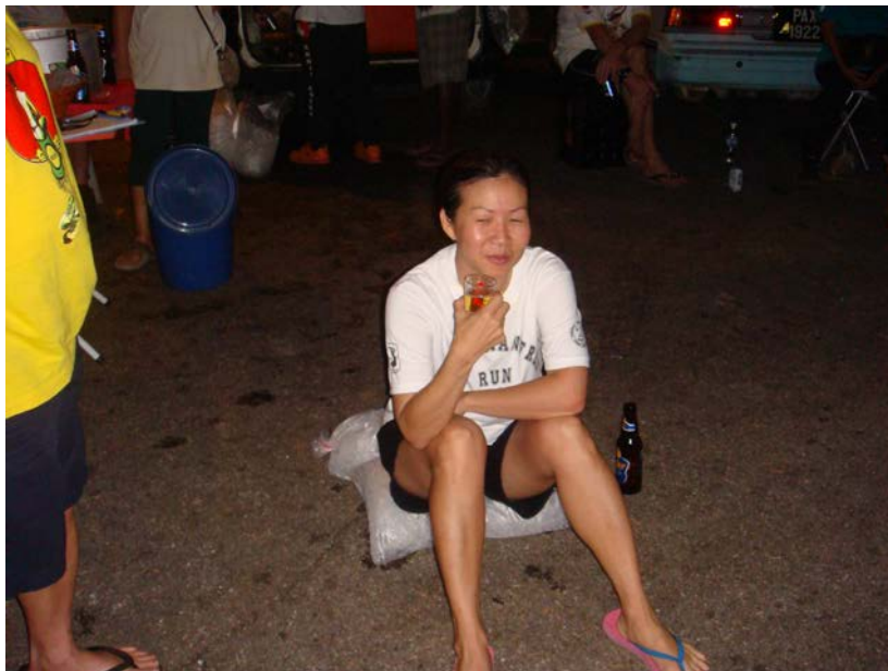
Cameltoe next, for starting the run earlier with FTAC members instead of with Harriets