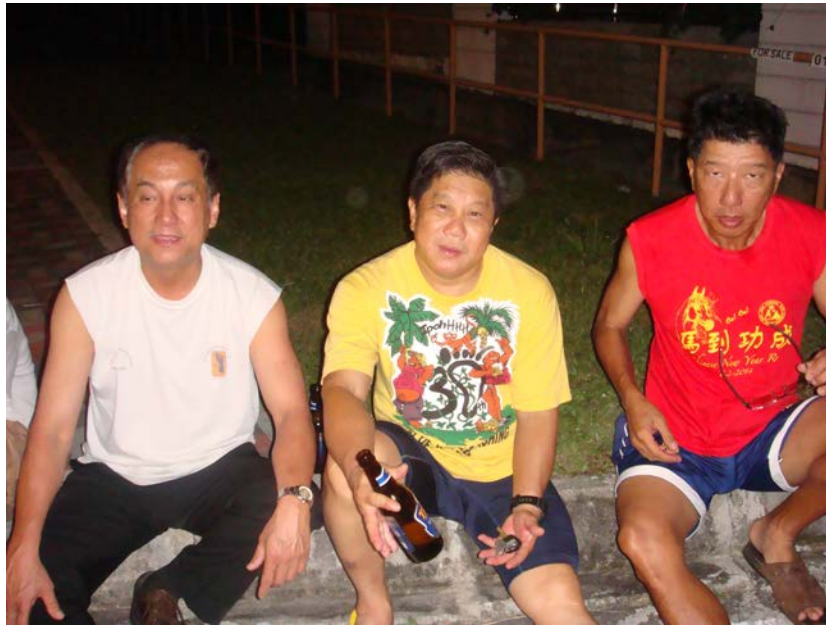
Three good buddies