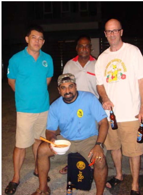
Handsome guys only from harriets