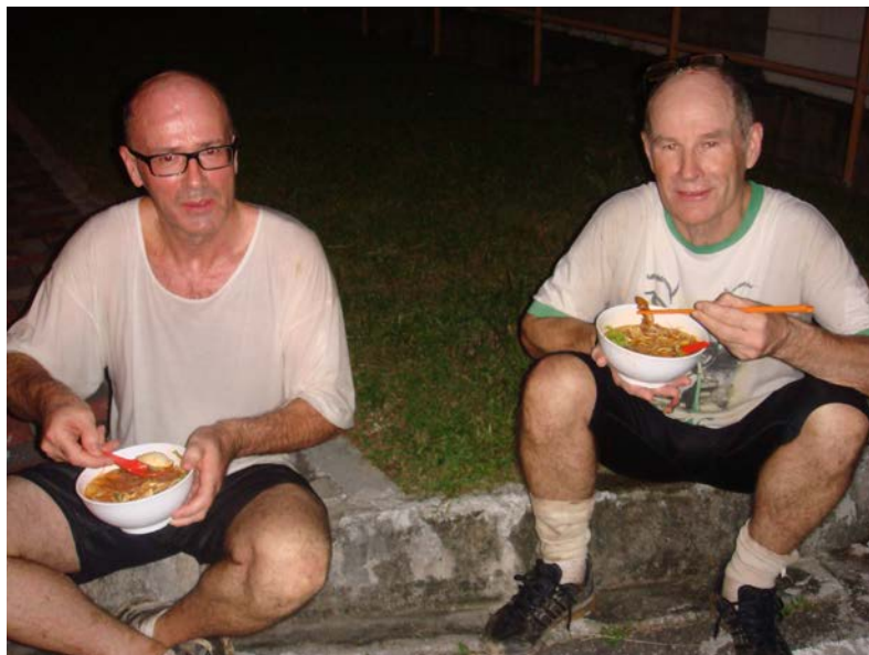
Delicious mee jawa