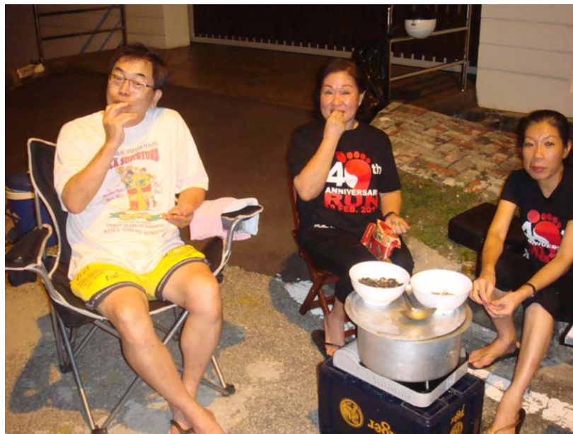
Enjoying the sunflower seed