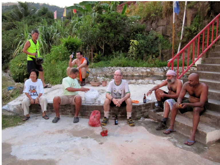
Enjoying the nice breeze and scenery