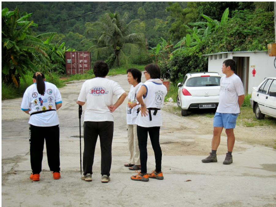
What are they looking at???