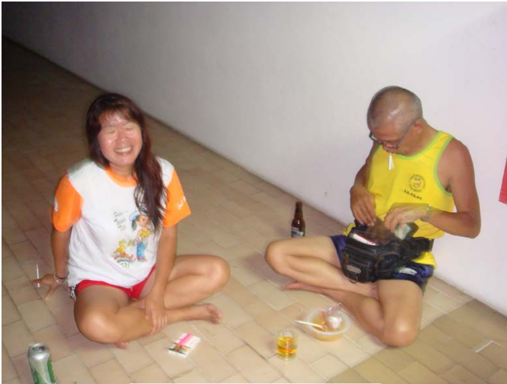
Drug addi ct???