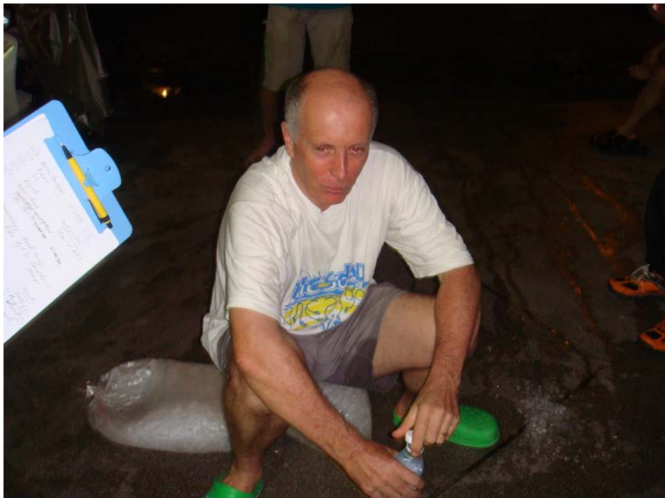
Pukka Sahib acknowledged as the "last" runner who completed reverse run on Labour day in over 5 hours!!!!