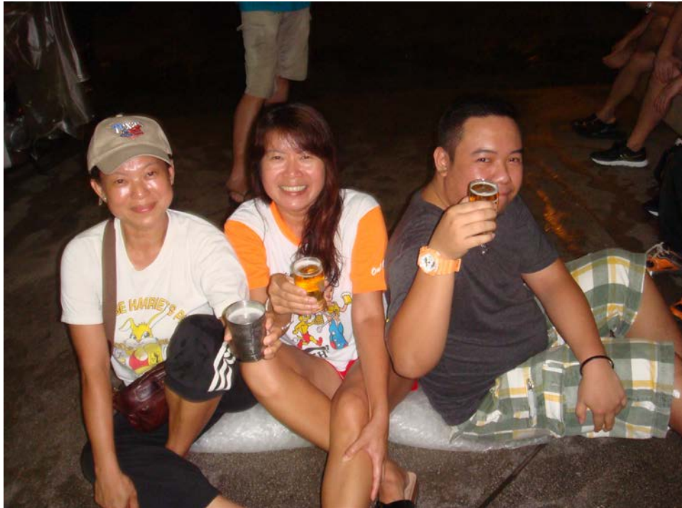
Guests on ice- Texas and Woobly Tits and Wind