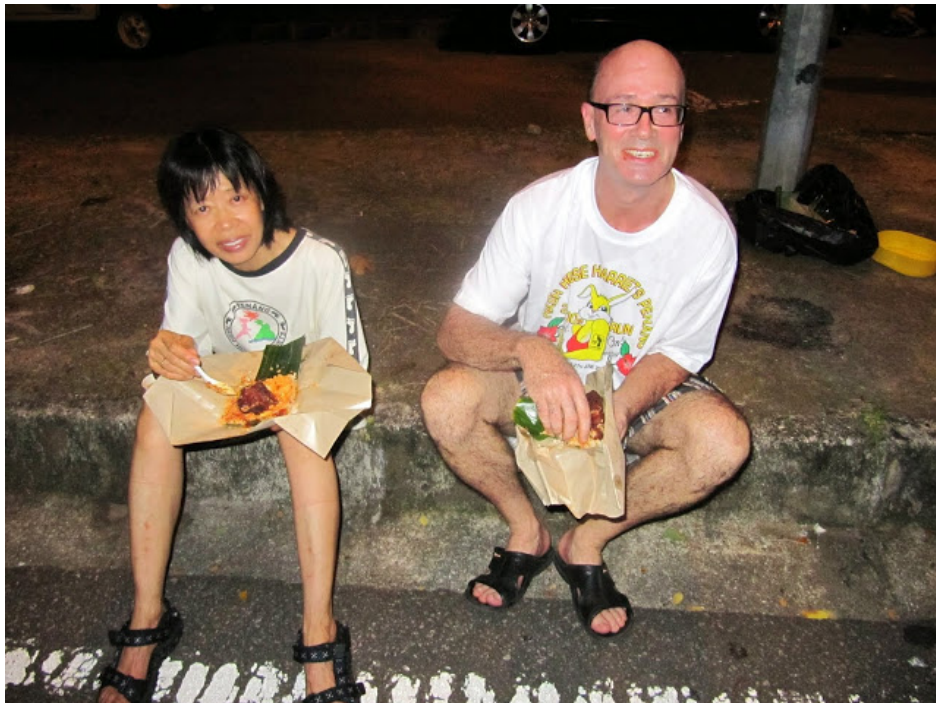
Western and Asian culture