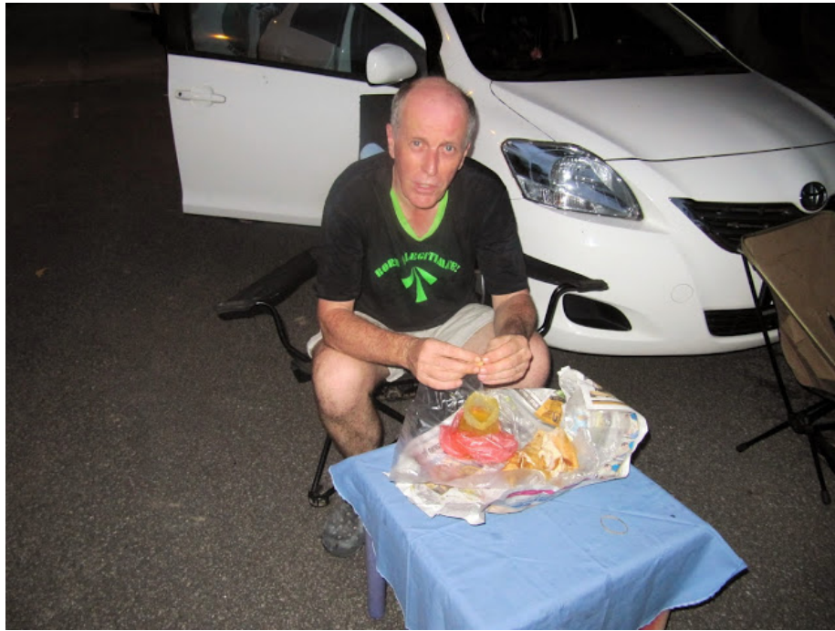
Happy with 2 dosai