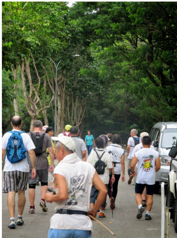
Cha Cha ..left, Cha Cha ...right