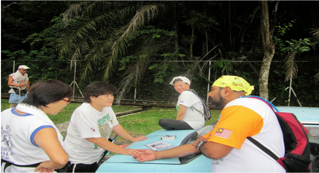
Discussing the route before the run