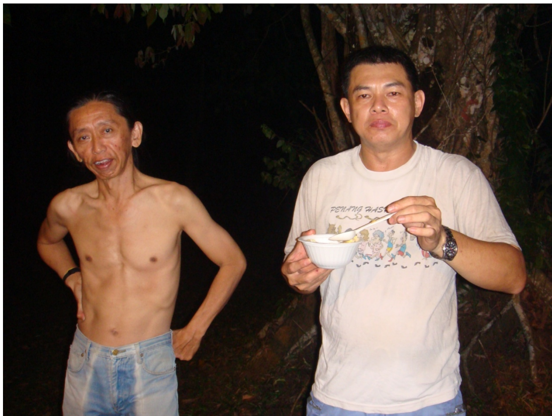
Look at their size....with and without food.