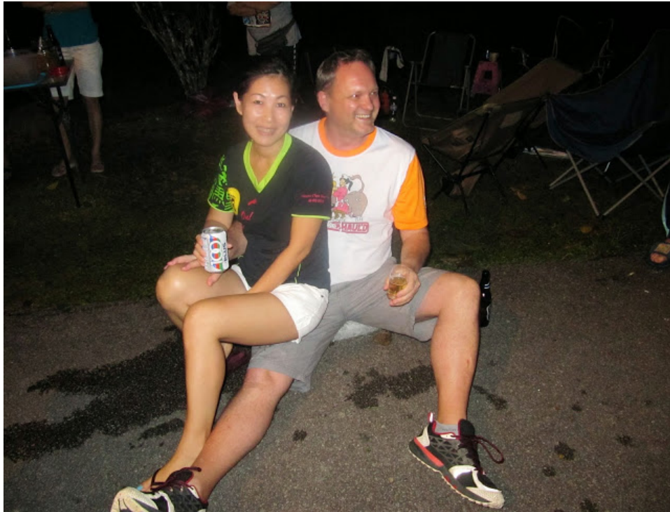
- Call girl and Pimp next for joining in as "Dinner Club" hashers