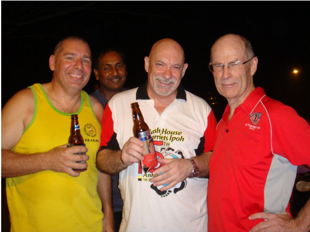
3 whites and 1 black