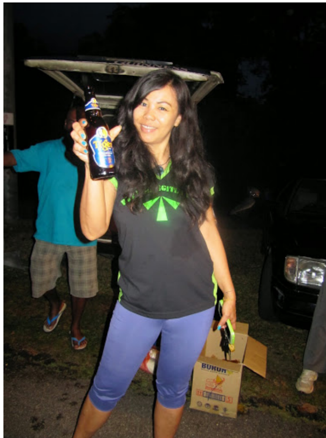
New Tiger beer promoter....