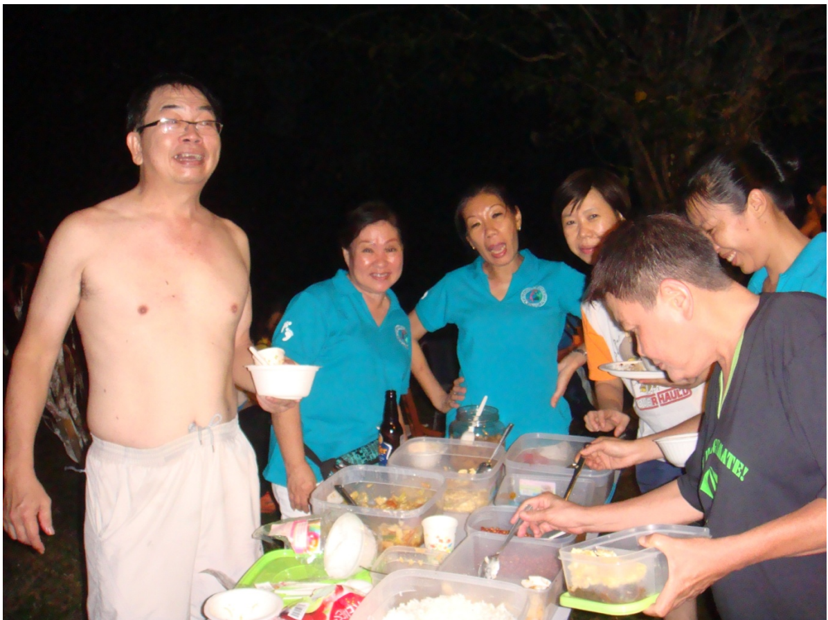
Hey uncle bee...leave some for others