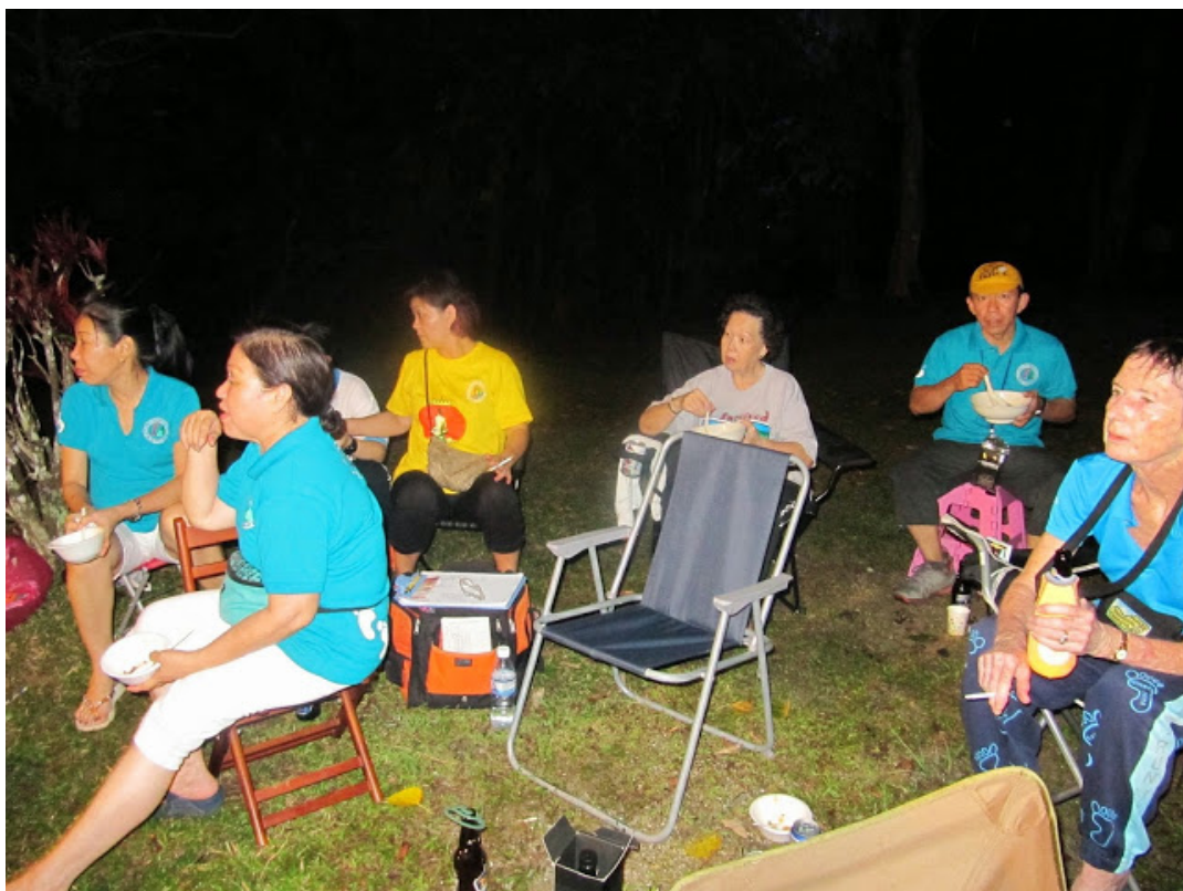
Hey ladies...look at the camera