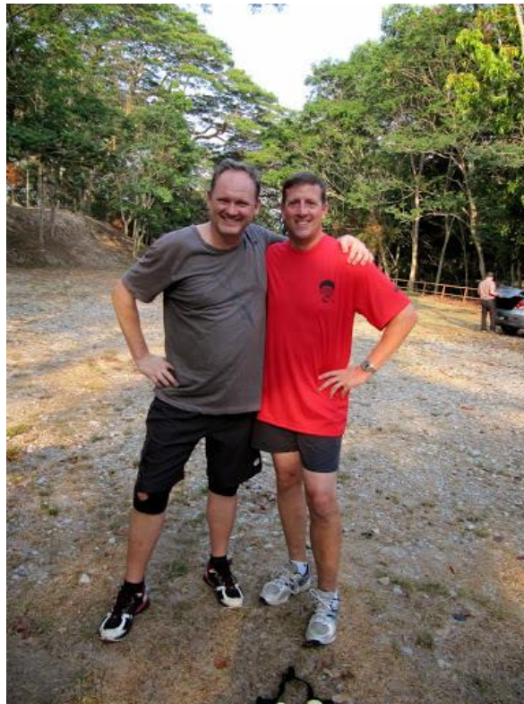
BROTHERS IN ARMS