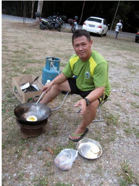
2 EGGS AND 1 SAUSAGE