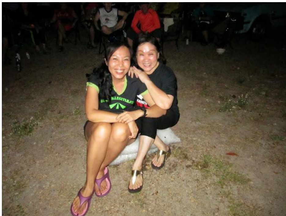
LADIES OF LEISURE