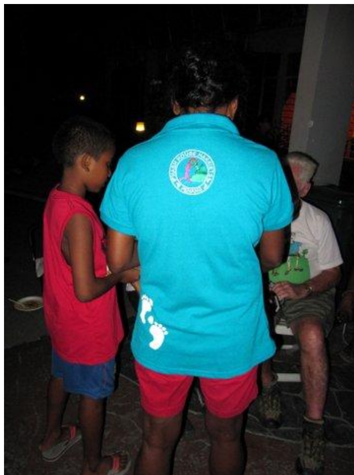
BACK OF THE NEW CLUB T-SHIRT