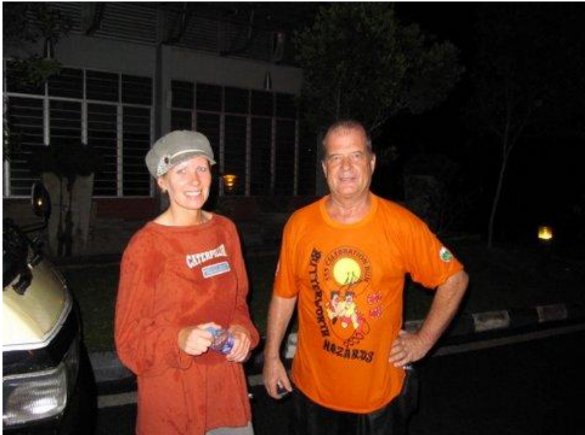
SPRMWHALE AND FRIEND LOOK A BIT SWEATY!