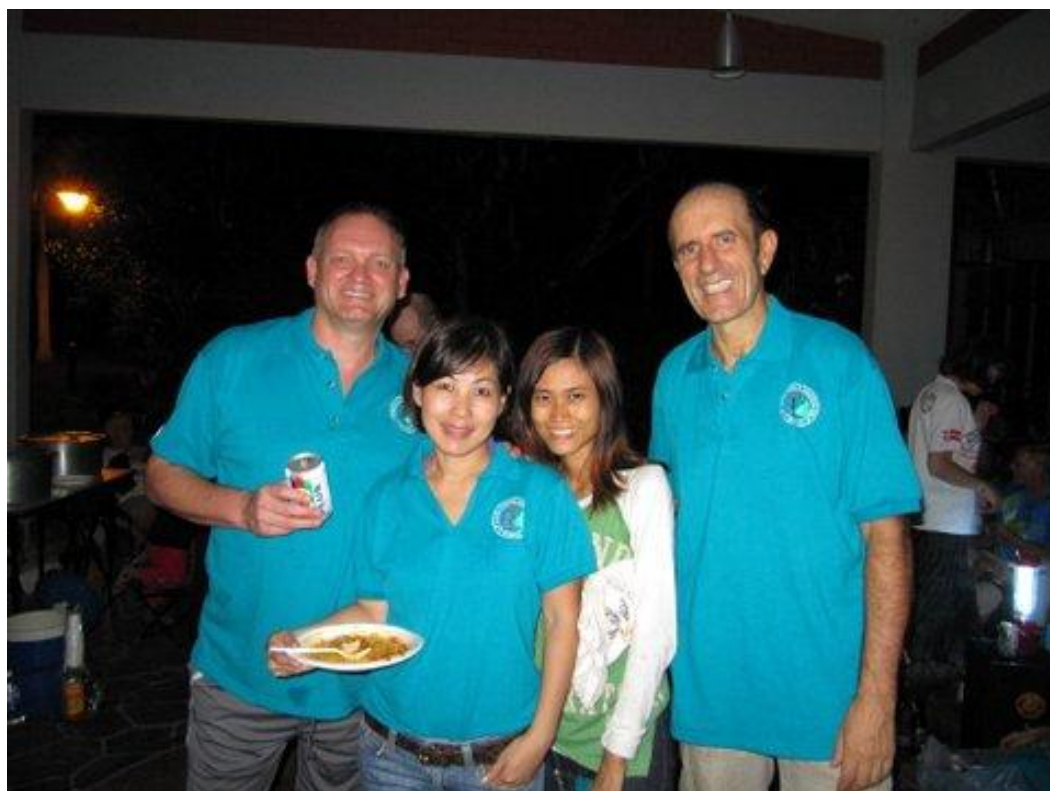
FRONT OF THE NEW SHIRT (THERE'S ALSO FEET ON THE SLEEVE)