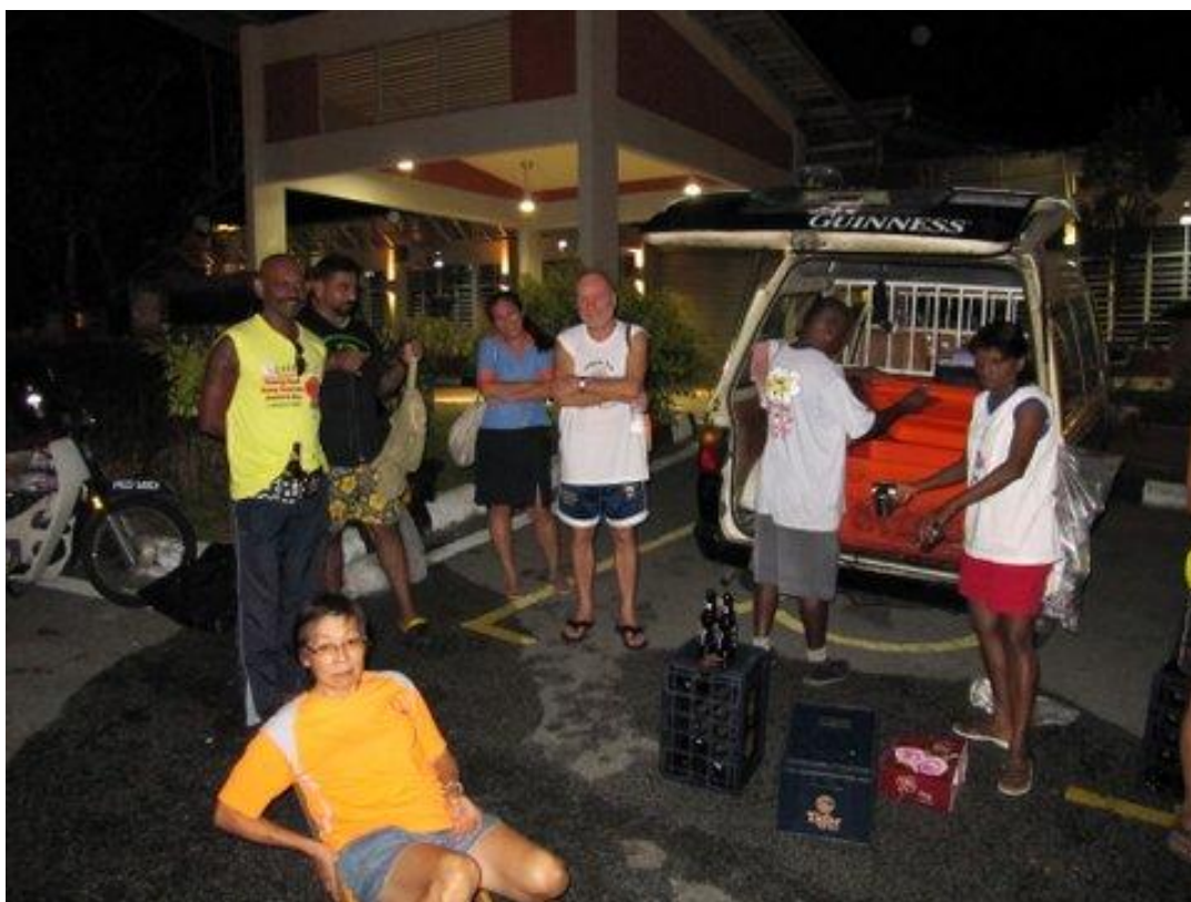
"I'm knackered" says Mother Hen