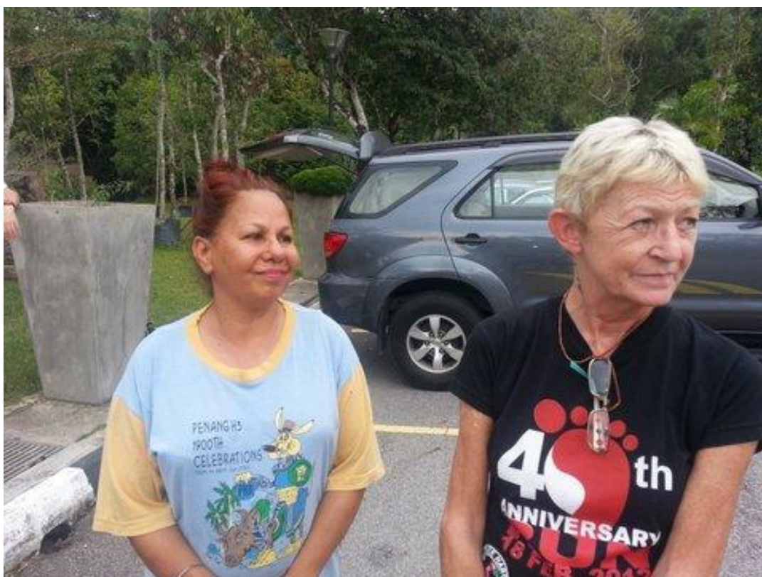
It's something that way ➡