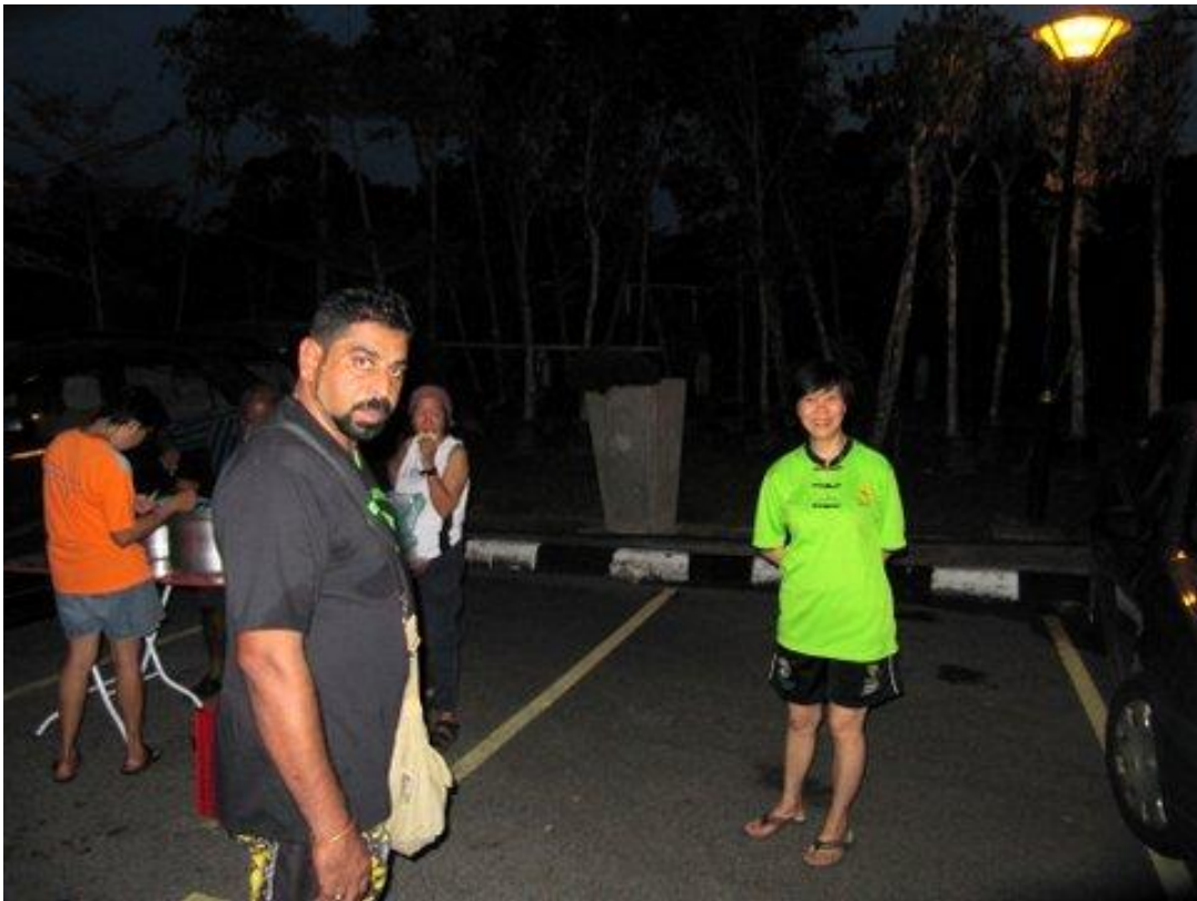
Smiling Horse with lost smile. Now War Horse!!