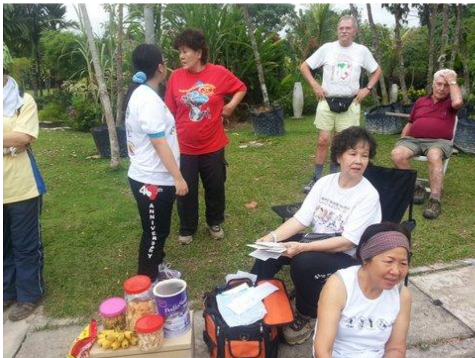
Getting it all sorted before the off.