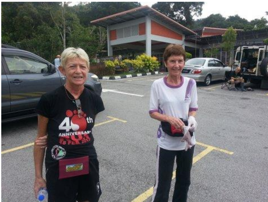
Tiny ready for the off while it's always good to see Whatever at the run.