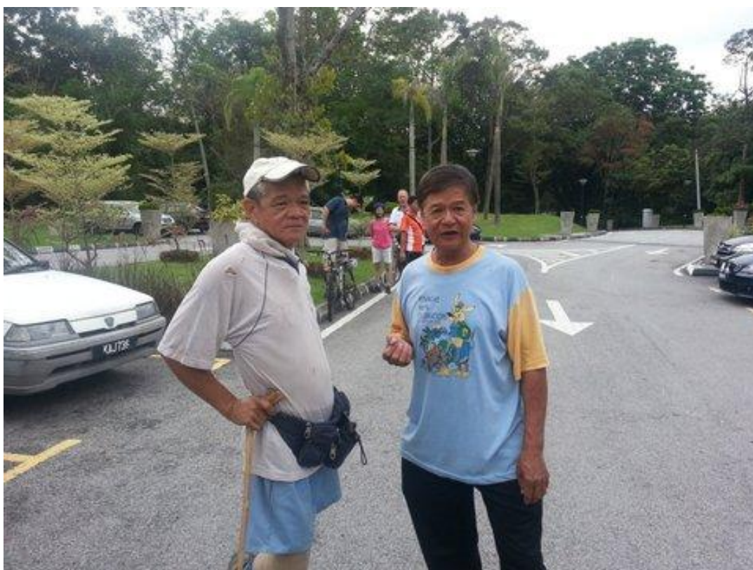
Even Take Care and Good Licker look calm