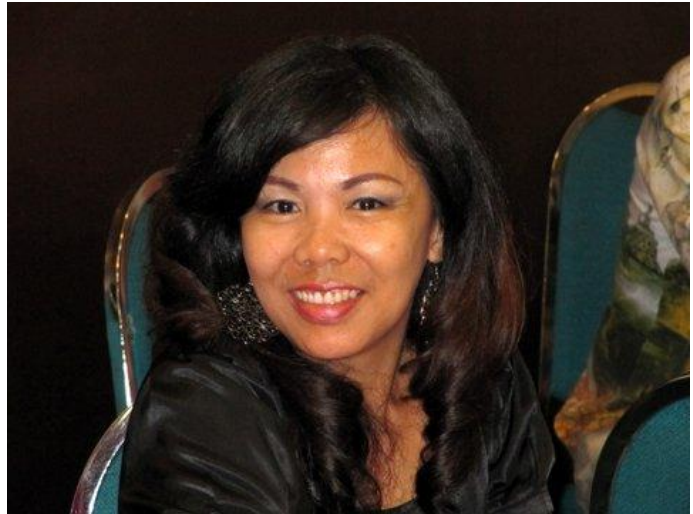
Keys In the Crack