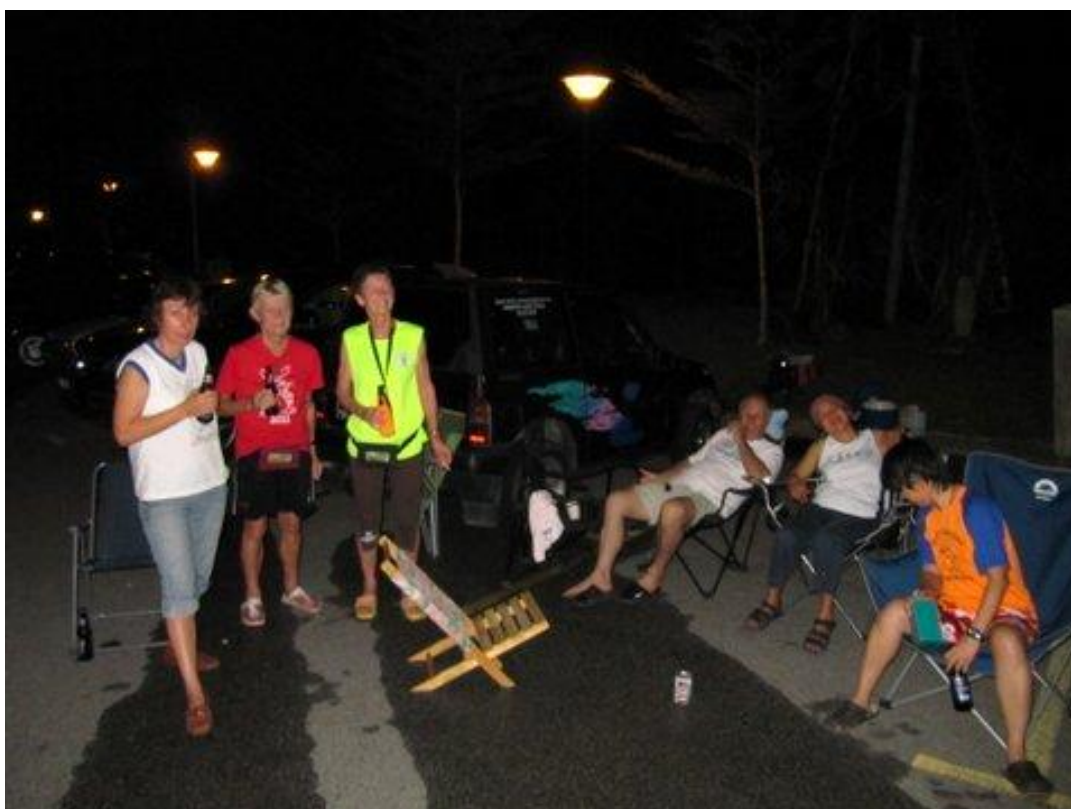
Enjoying the night and the Tiger