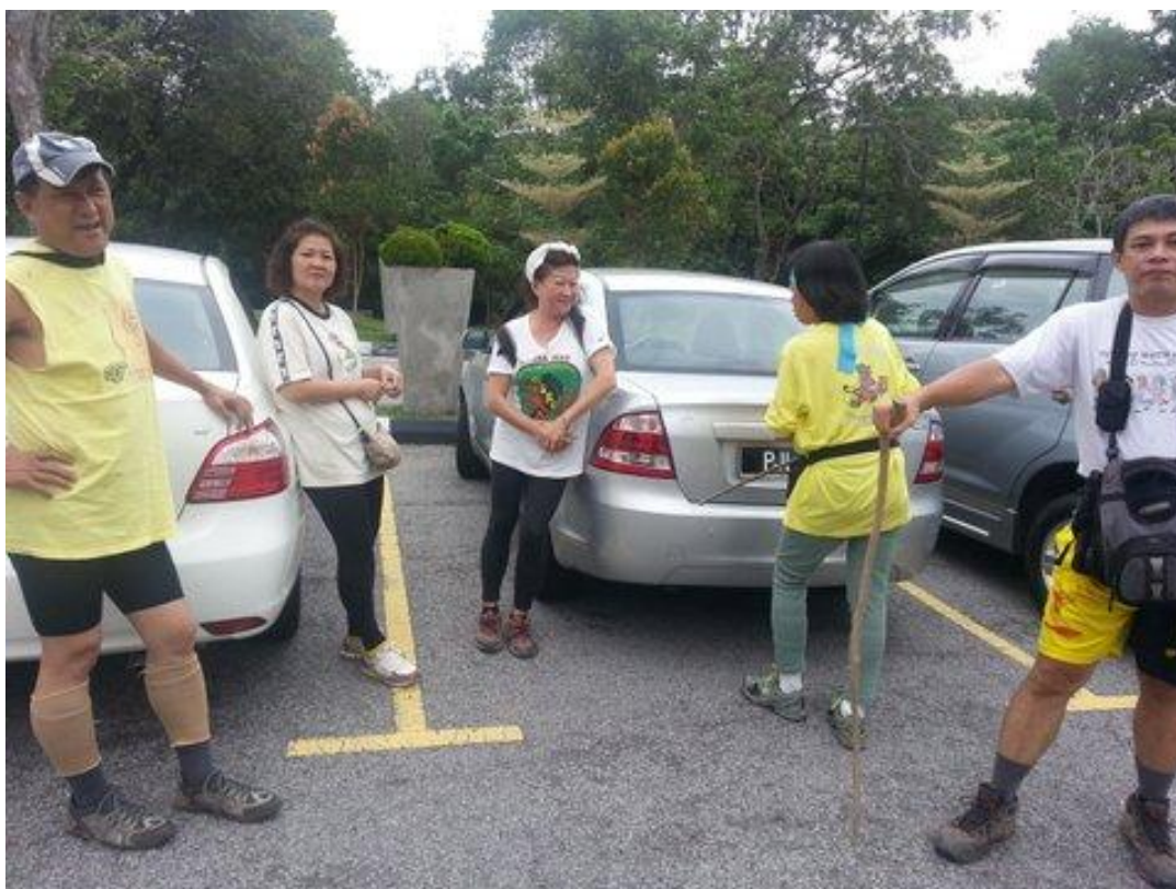
It always relaxed when Silent Man stands guard!!