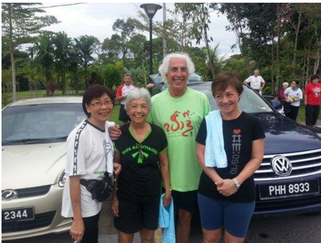
You can see White Lion has an eye for the ladies!!