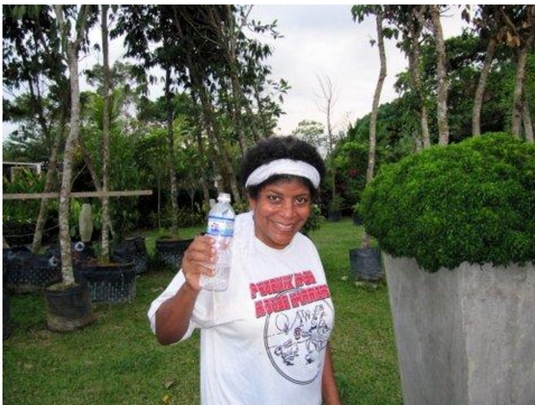
Spanish Fly flew in for a quick visit.