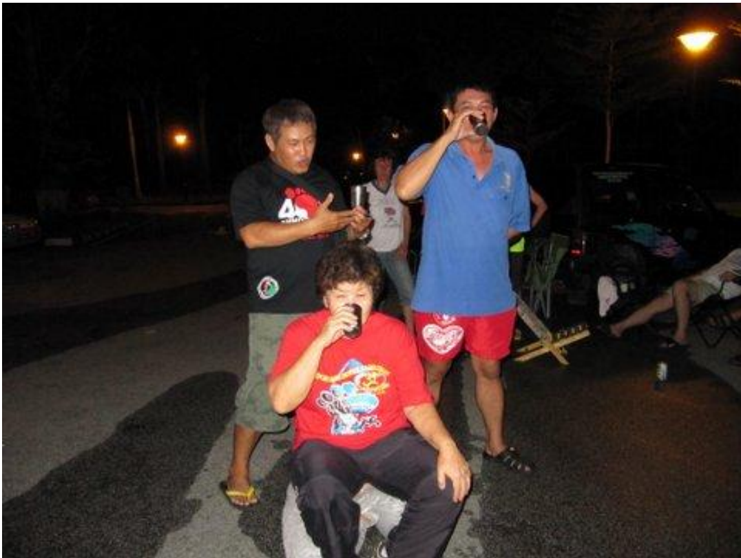
The Bunny and her contractors. Thanks to you all we had a great night!!