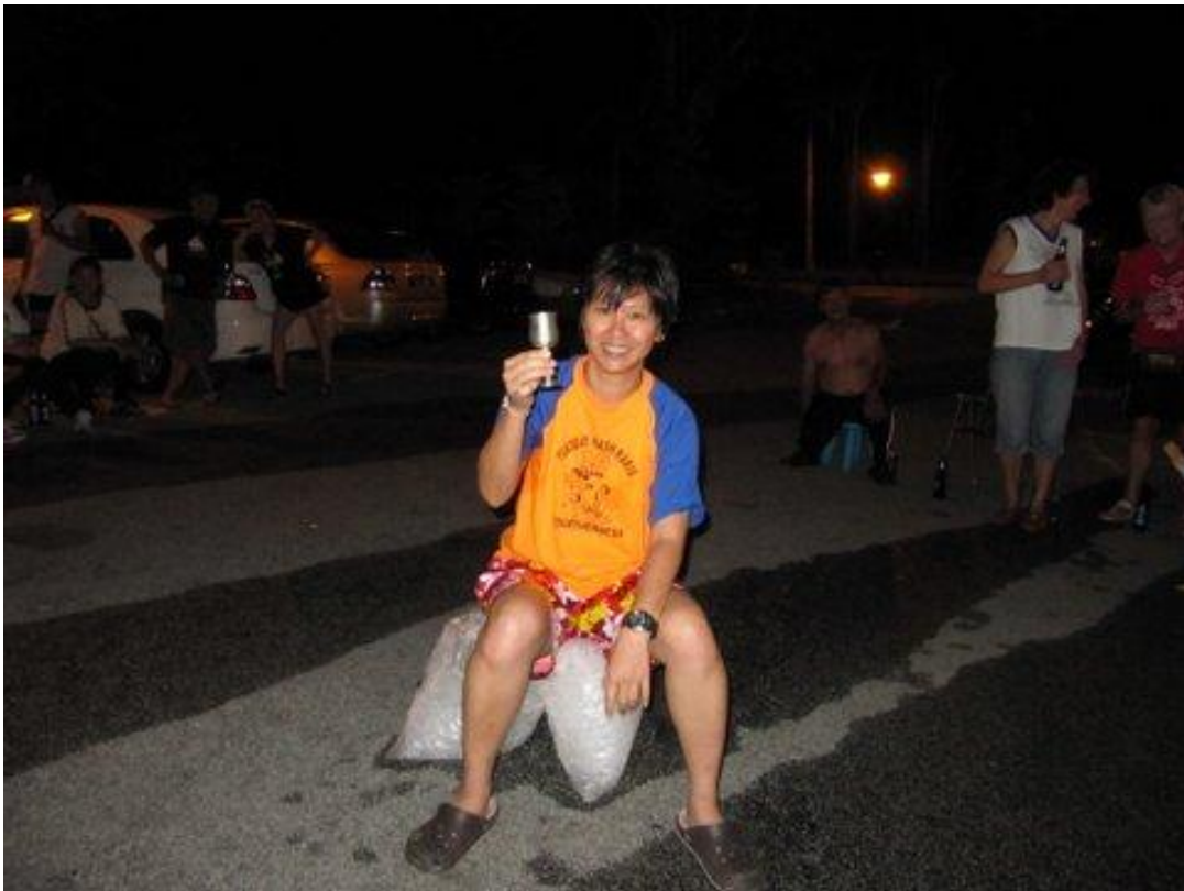
Posh finally made it to 200 runs. Congratualtions!!