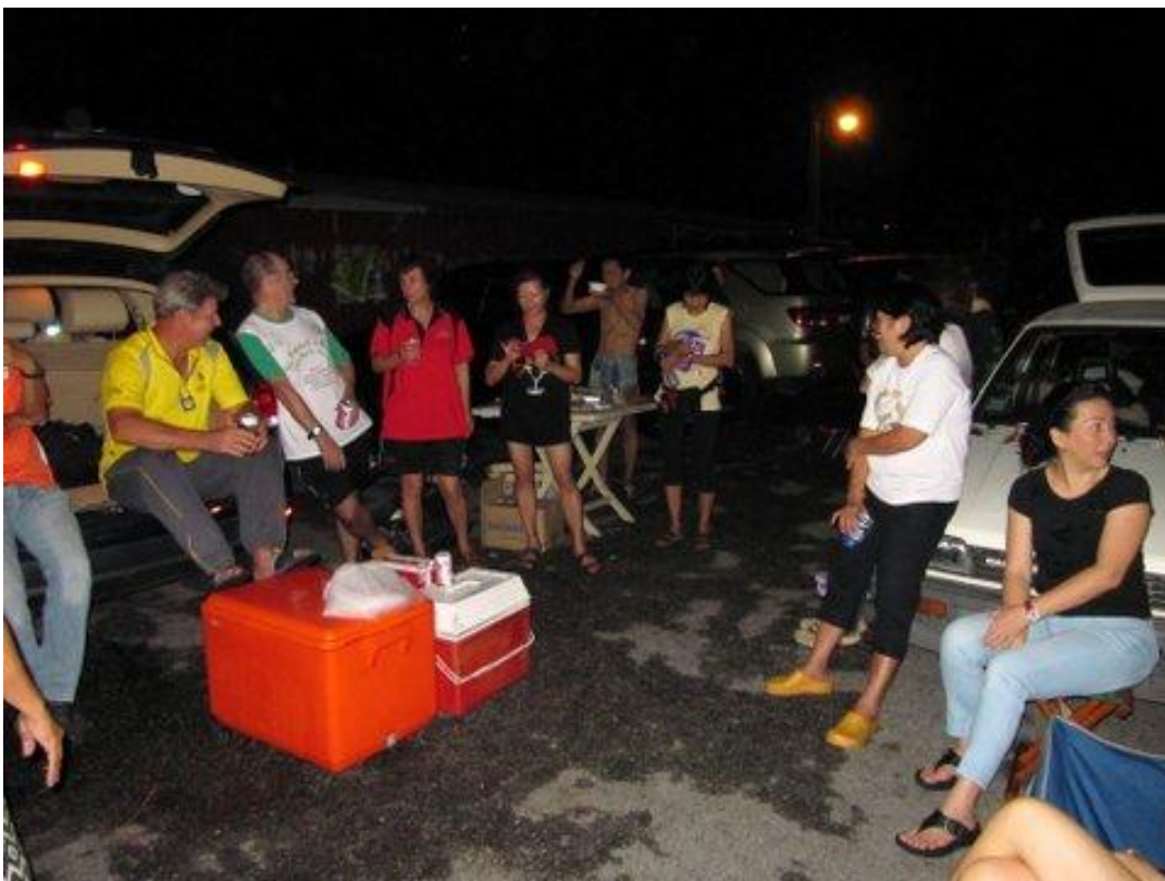
Everyone was having a great time.