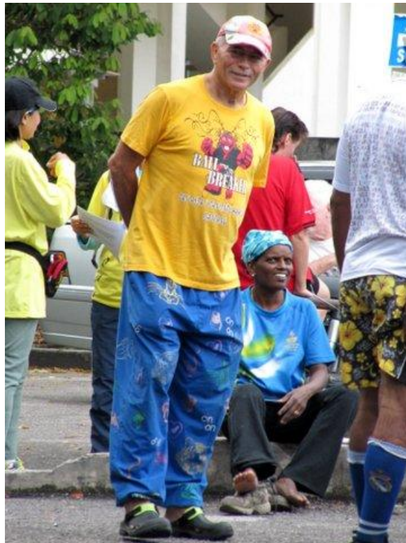
Cock-Hare Money looking smug!!