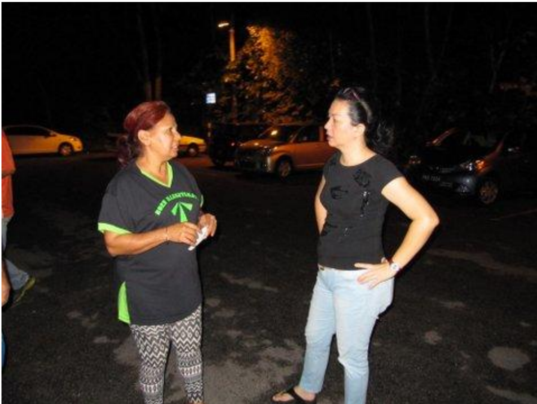
Girl talk...the GM and G-string.... Mmmm 3 Gs