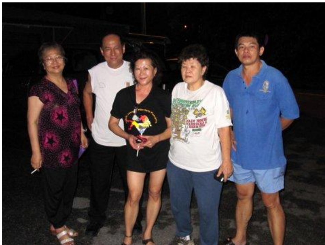
We really do have some great members