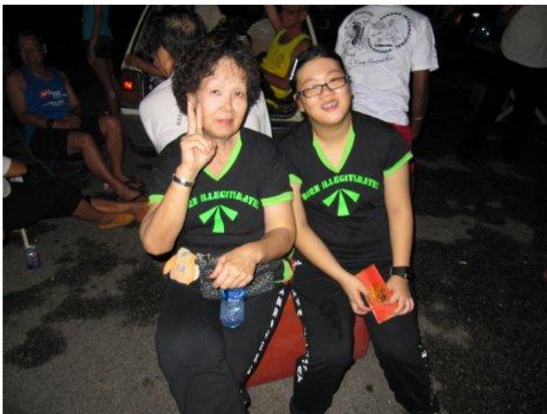
A couple of escaped convicts perhaps!!!