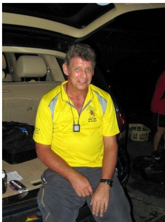
Whilst the other cock-hare, Mini Sausage, had to act as beerman for the evening!