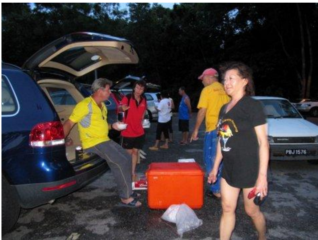
Beauty and the Beerman!!