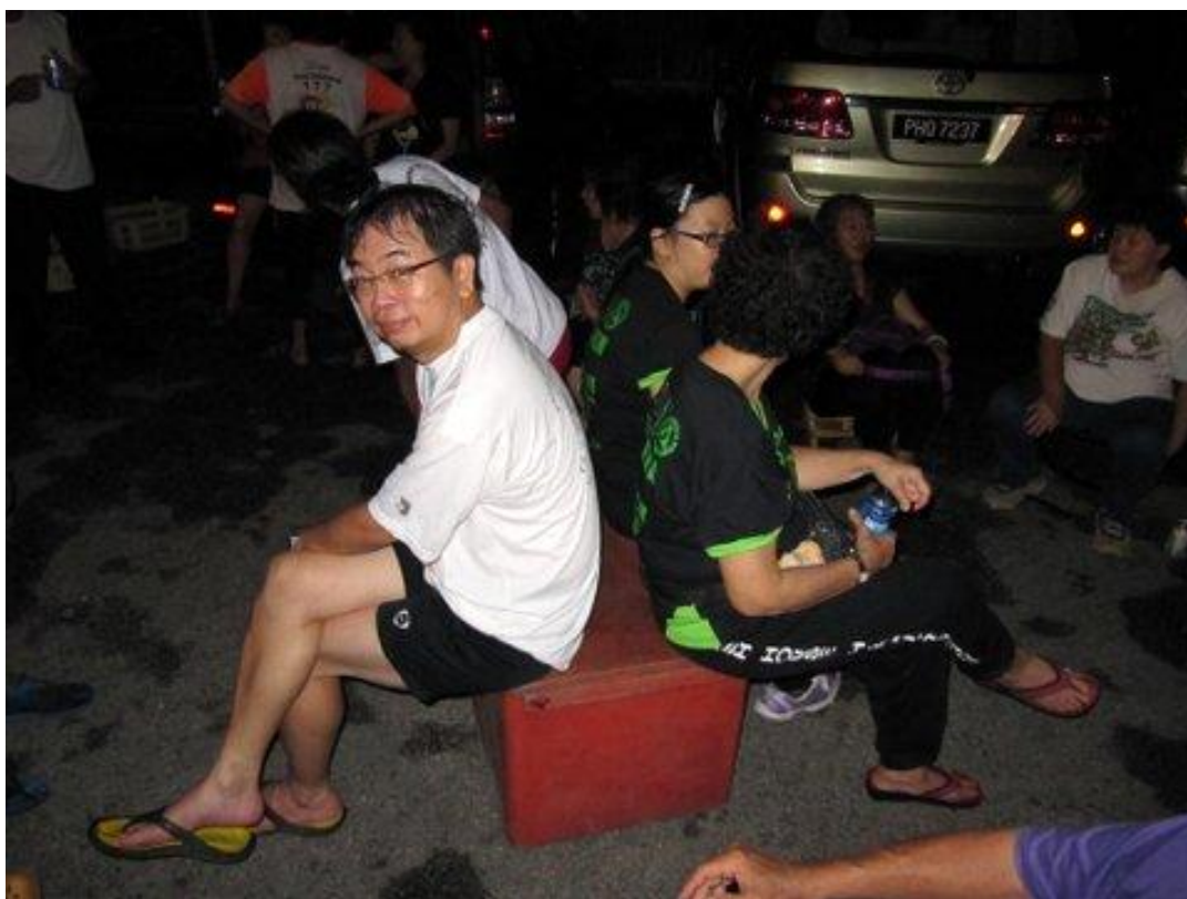
No, not an icing just seat sharing.