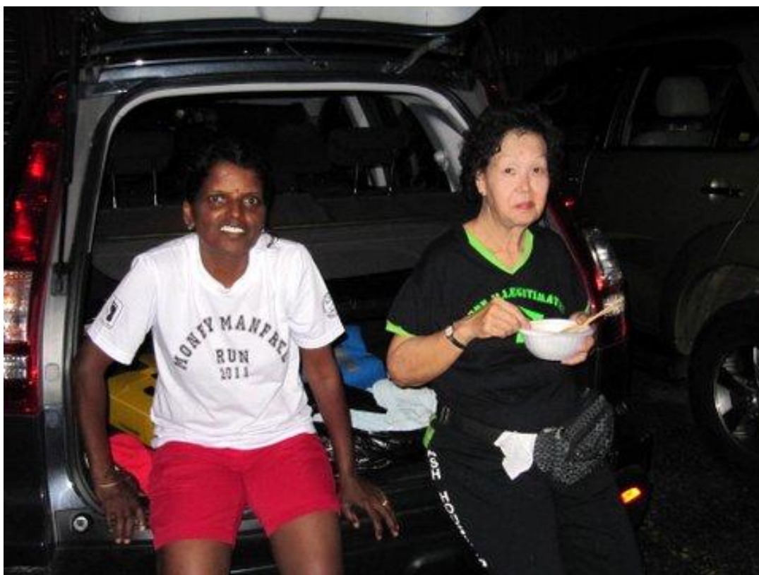
Molly looks not too happy unlike Speed Hound!!