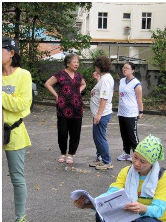
Rupiah catching up with the Harriet news, Whilst other do it the old fashioned way...by chatting.