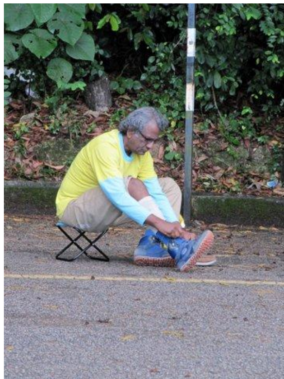
He should have talked with Black German. Look at those soles!!!