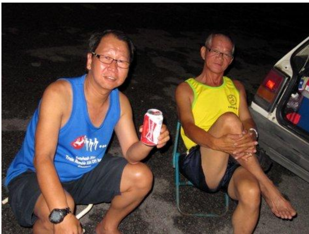
Two more cock-hares...taking it easy!!