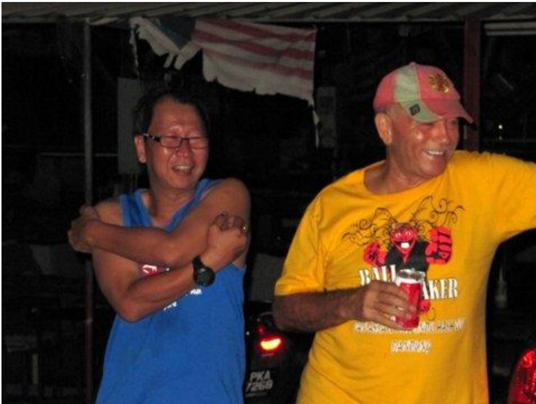
Especially the cock-hares