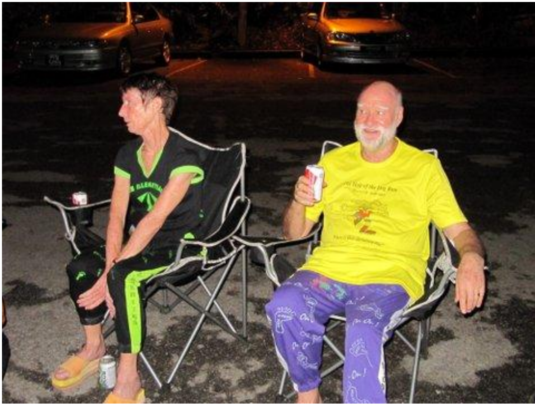
The members were happy with the beer though!!