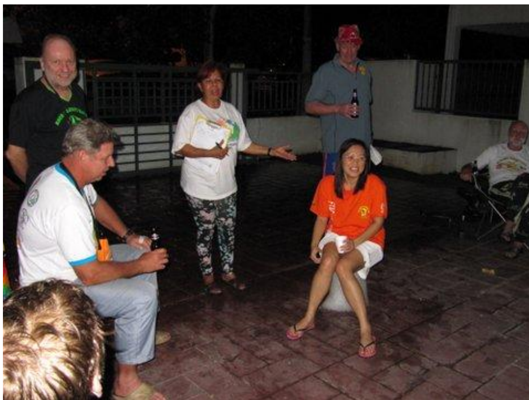
Some people never learn!!