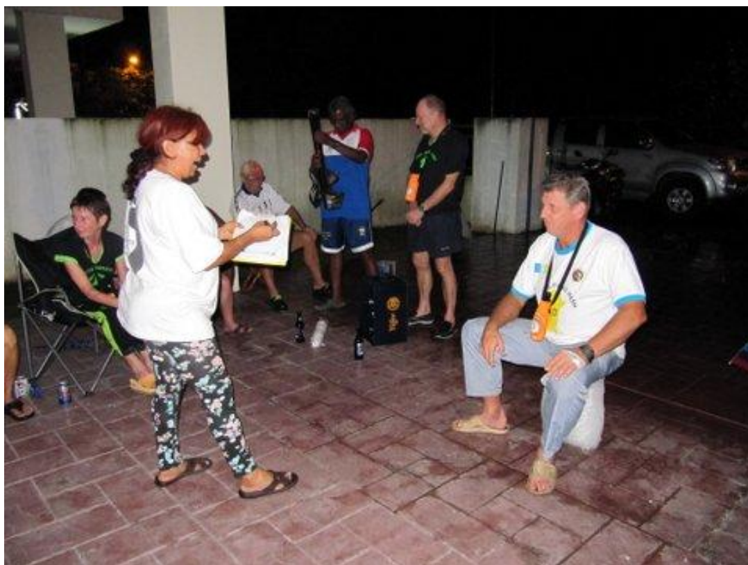
It only a mini hand job!!