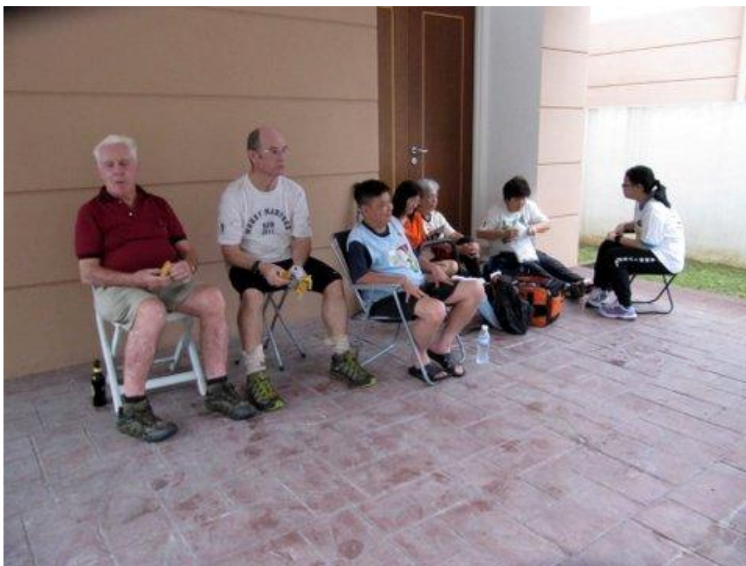
Veteran Hashers either sleeping or not impressed!!