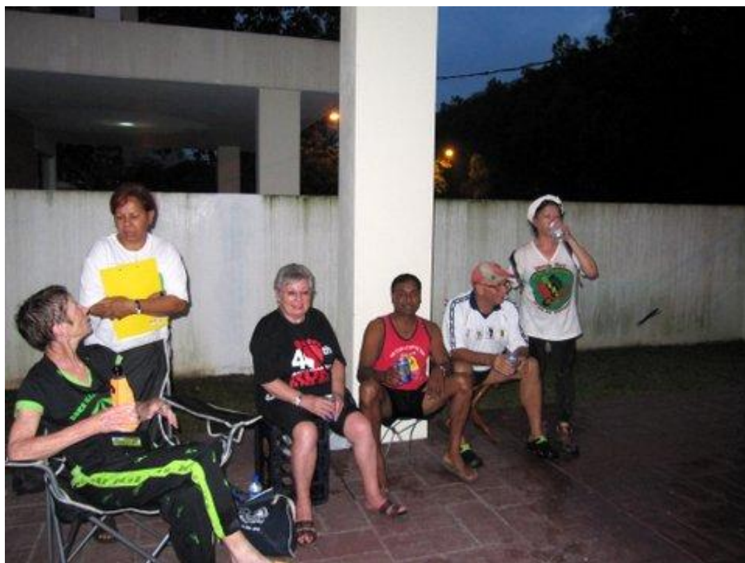
The wind has changed it seems!!