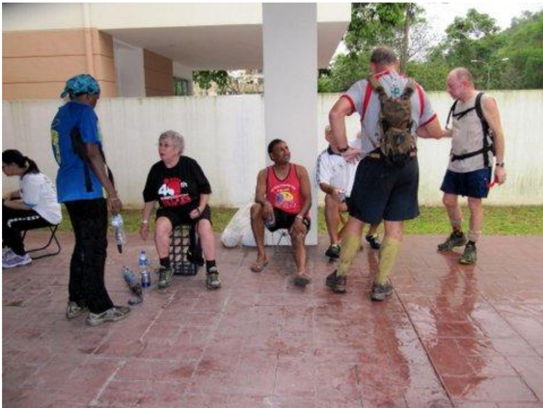
What's all this?? Hashers taking refuge!!!