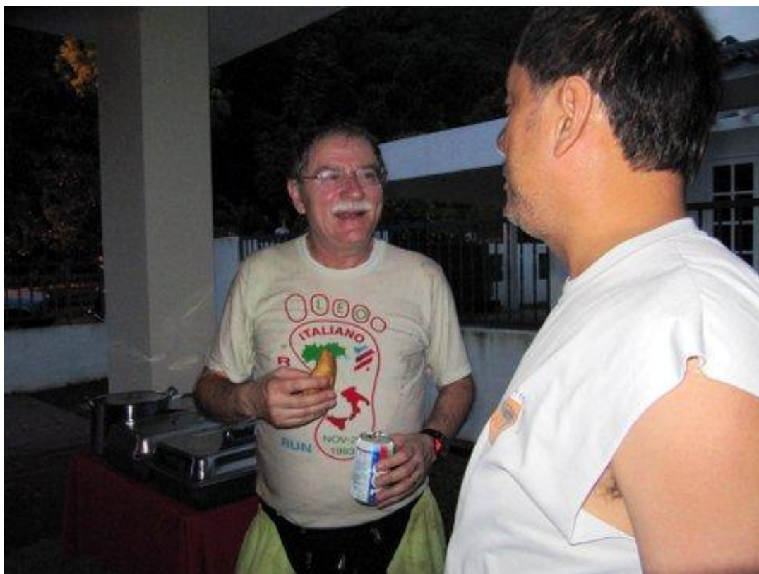
Italiano before he "pastaed" off