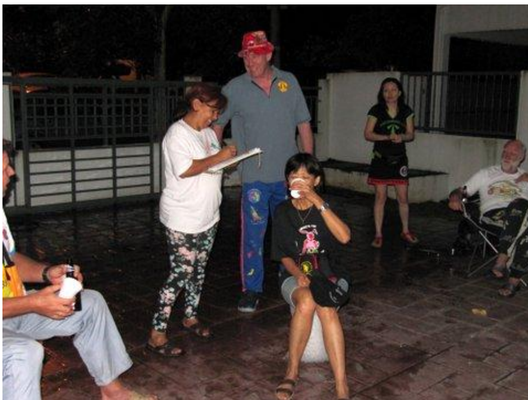
Pussycat back in full view. Welcome back!