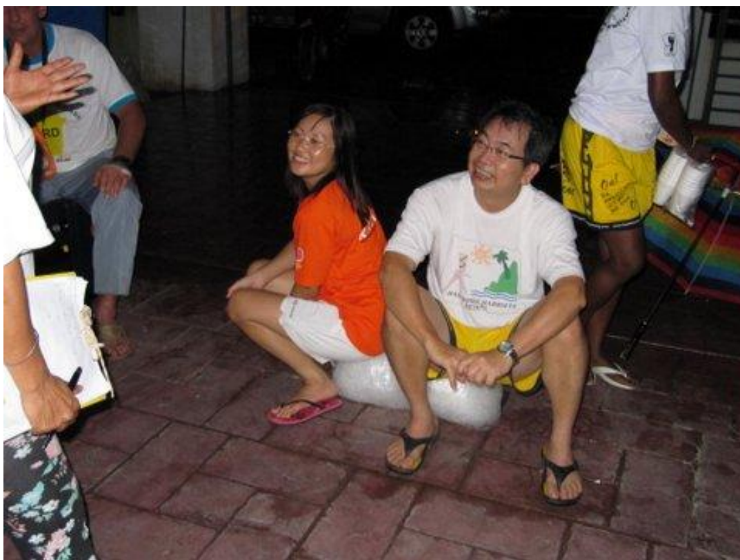
The Discovery Channel – A Hakka Connection