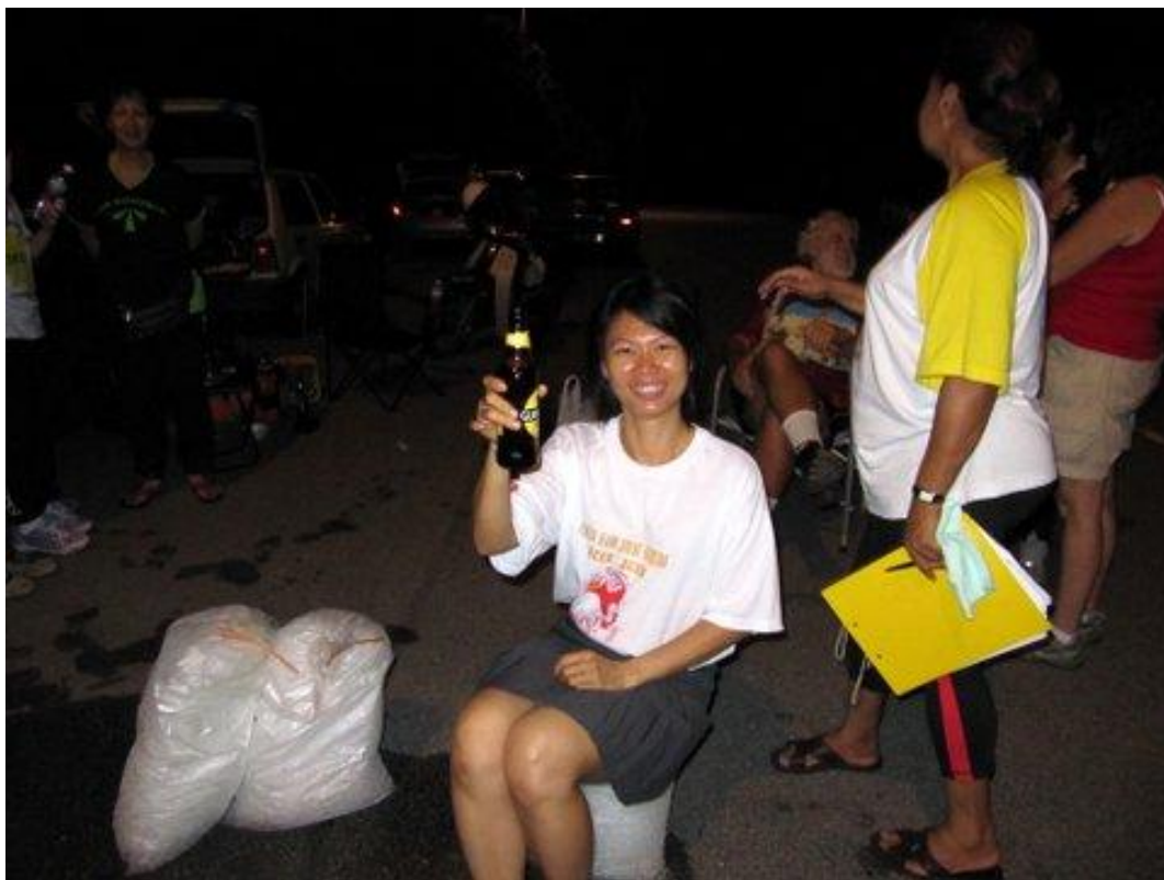
Good run, great food, Super evening by Supergirl!!