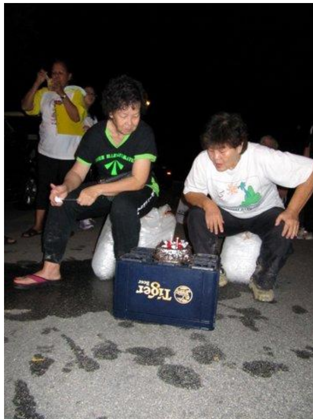
HAPPY BIRTHDAY to December Babies!!