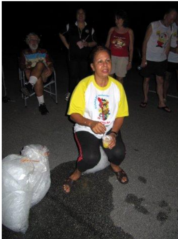
The GM was parked too near the junction – typical Malaysian Style!