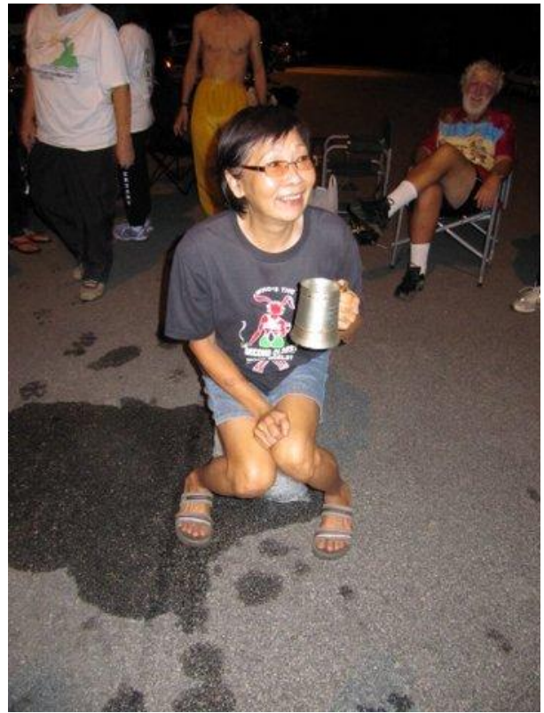
A Special night for Mother Hen – 1700 runs can you believe that. Many congratulations