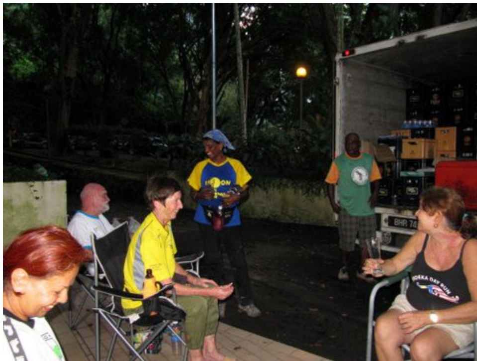
It must have been a funny one!!!