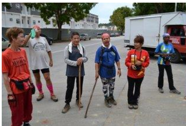
A few words from our GM...