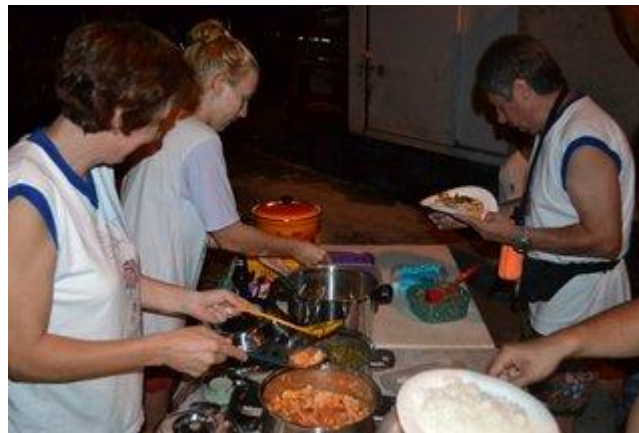
"No run-No food" says the Hare!