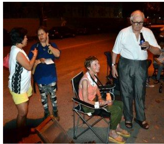
And catch up.