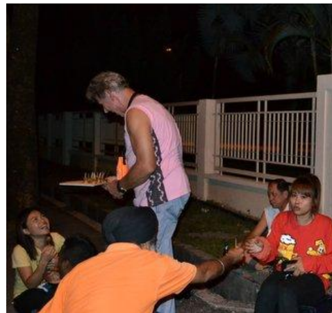
So, some get to nibble his famous sausage...