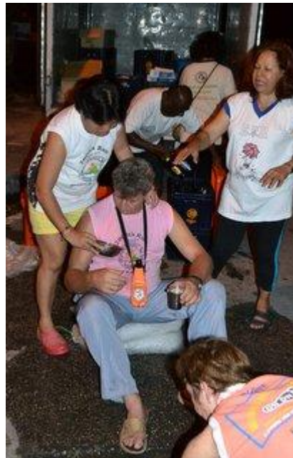
Hunger can make people quite savage!