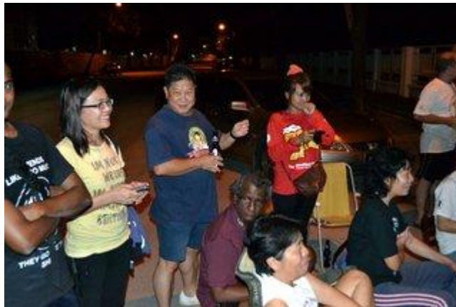
But the pack enjoy the show!