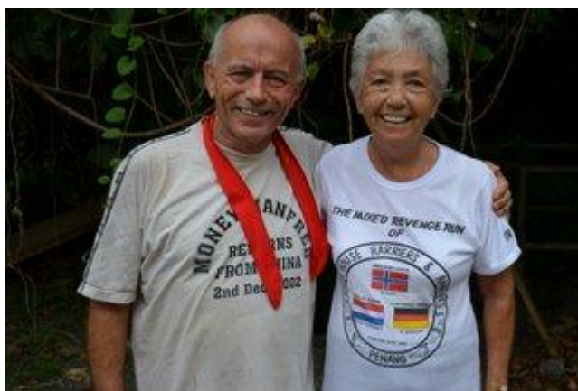
Money is thrilled to see Grandma wearing his revenge run shirt from 1987!