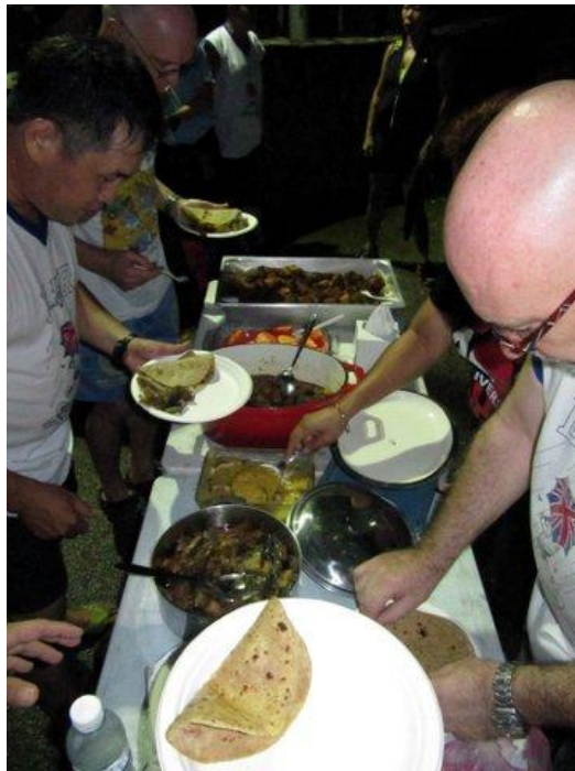
Chapatis! You guessed?