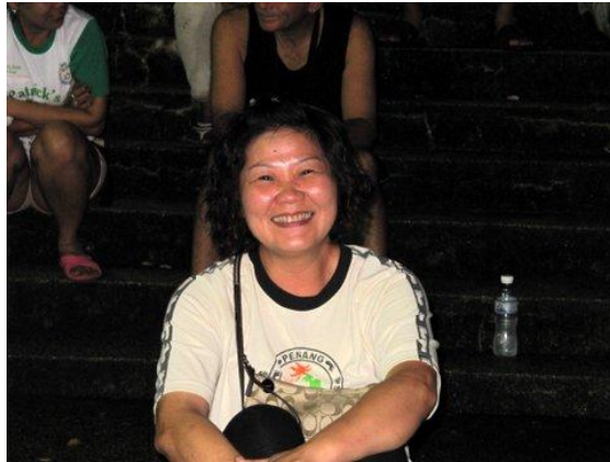
“NEW HAIR DO”