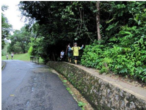
Through the Botanical Gardens