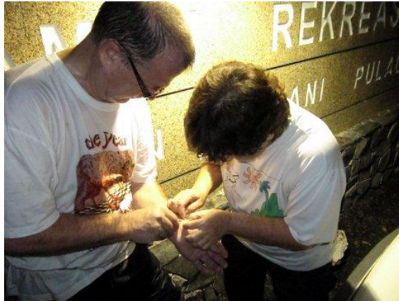
Surgery was performed