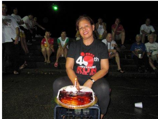
Happy birthday GM...