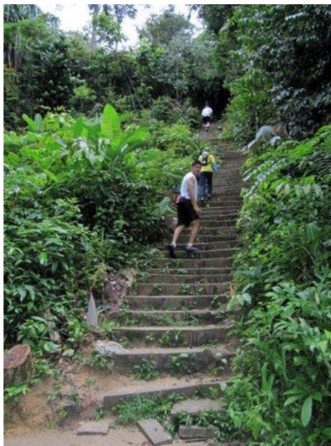
And up the steps