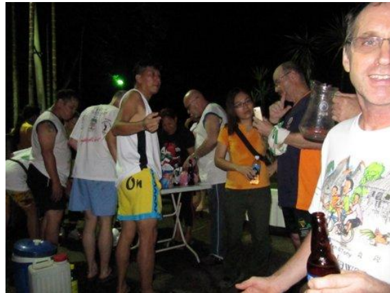
And food was served