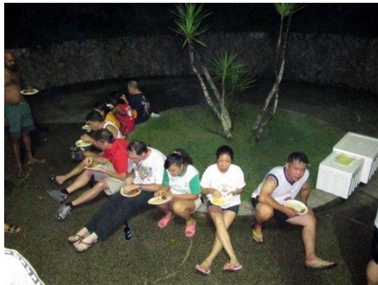
Enjoyed by one and all!!