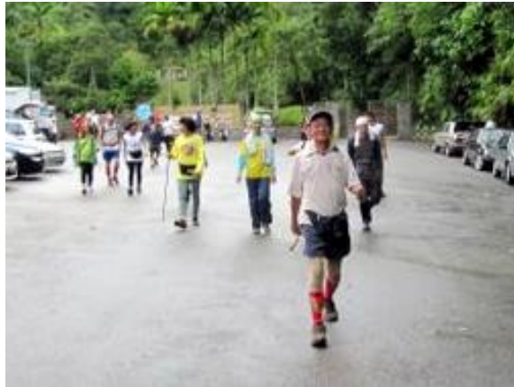
Followed by the rest