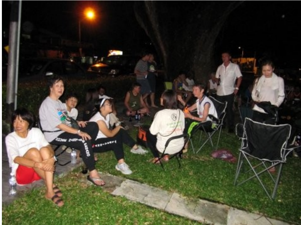
All girls together!!