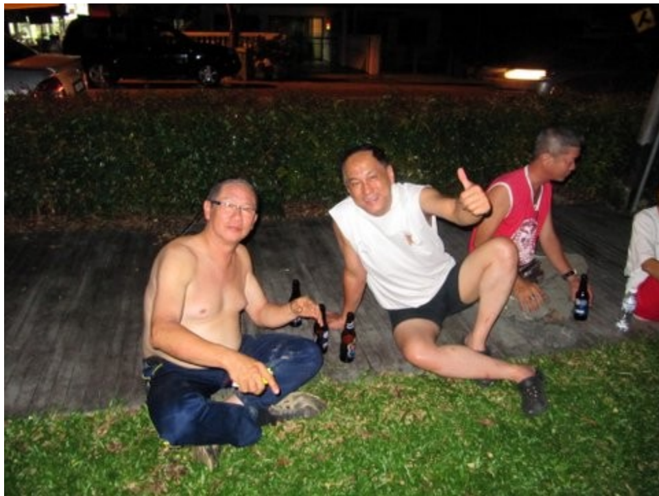
Friends having a few beers!