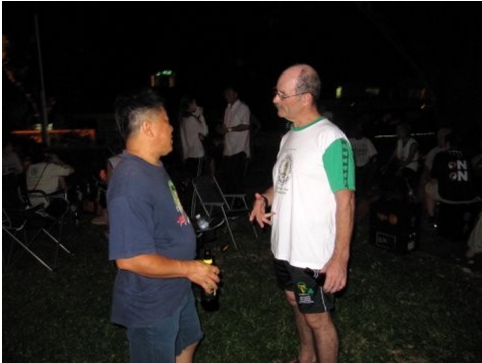
Iceman getting insider tips from the Hare