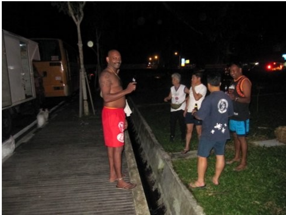
Grasshopper on the right side of the drain... The beer wagon side!!