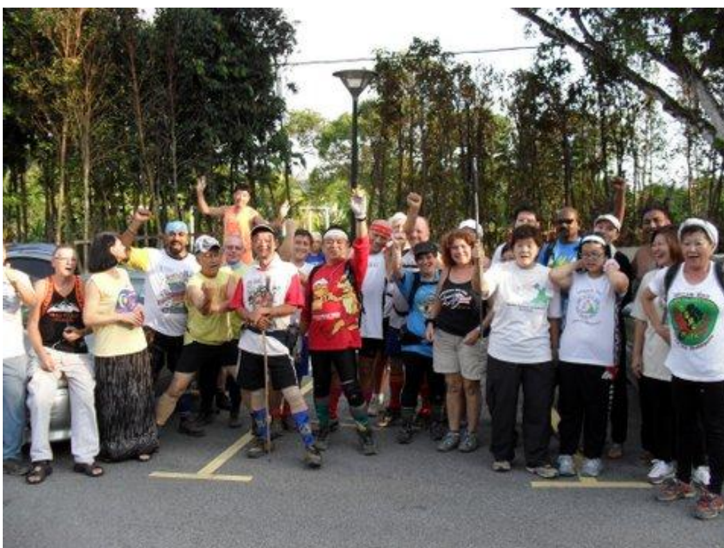
A good crowd!