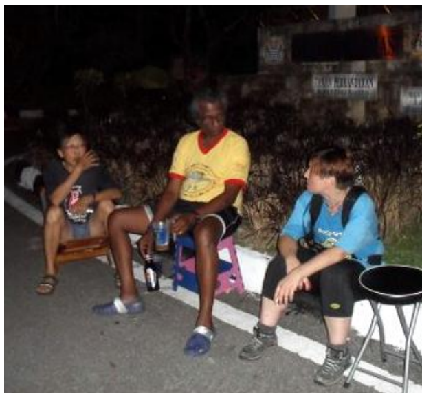
Black German brushing up his French