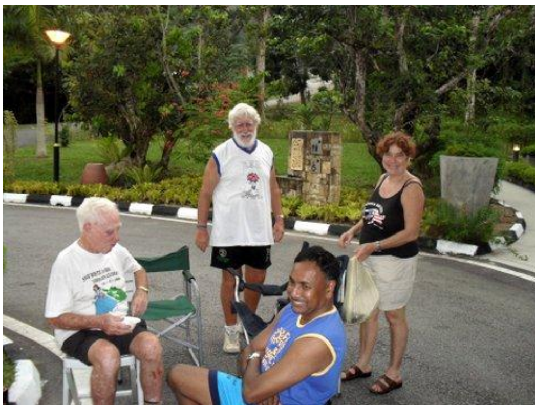
Front runners back