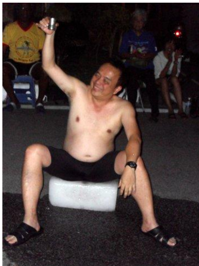
Bendover back on the ice