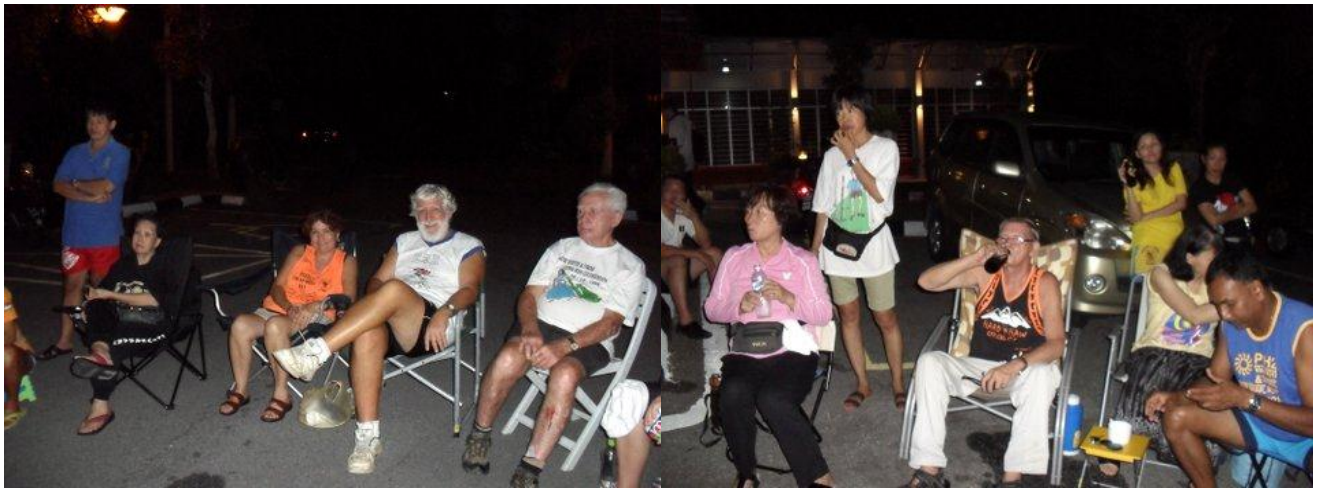
Luckily the GM allows sitting during the circle