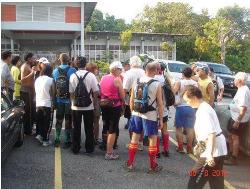
A word from the hare