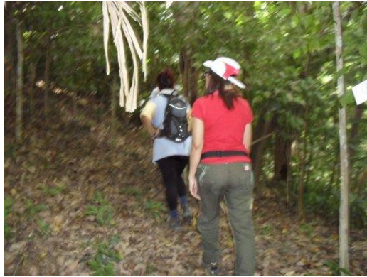
And into the jungle