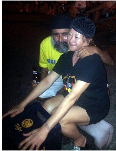
Twins? Same headgear!