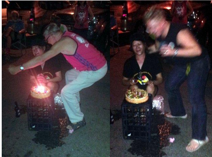
Kisses for the birthday girl