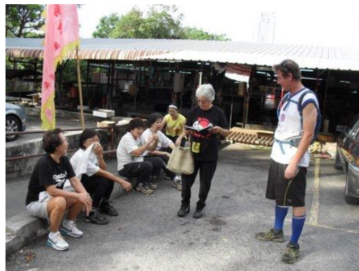
Filling up fast