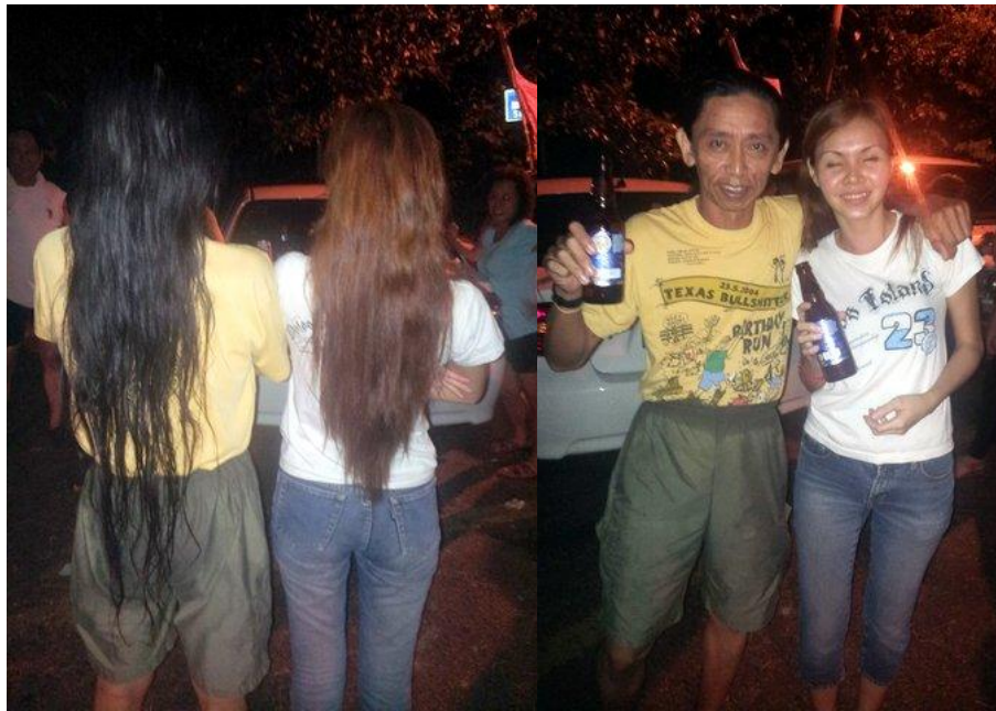
Siang siang..... tapi boh siang!