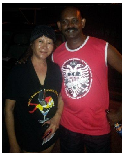
Hanging out together...