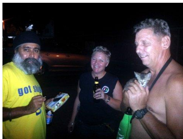
Playing with a pussy cat