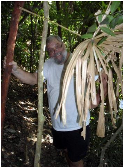
Where who-knows-what may lurk!