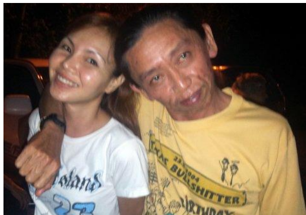
A great looking couple!