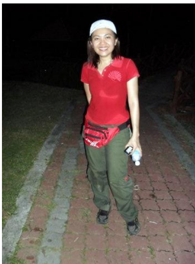
Looking fit, even after a walk back from Moongate