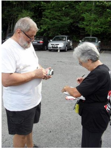
Guests welcomed and money taken!