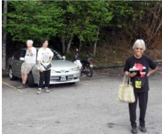
The first of the many