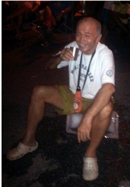
Nearly sitting pretty!