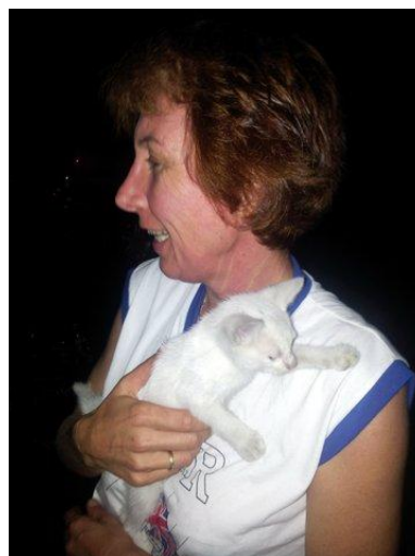
Some people just have a way with a pussy...