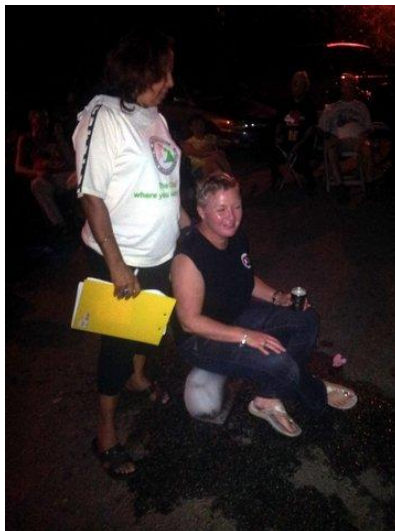
Bunny on ice...