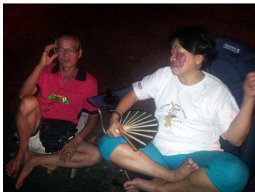
Joining a fan club...