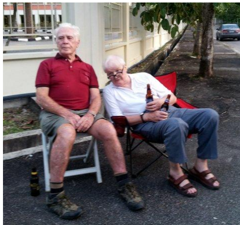
Our senior hashmen keeping an eye on things