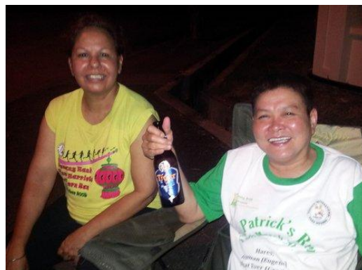
Our GMs, past and present