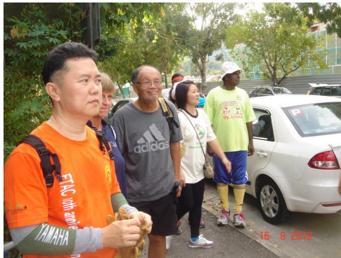
Standing by a tree waiting for a Hare (守株待兔)