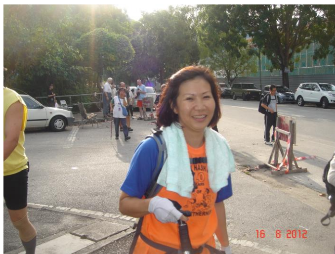
And the run moves off.