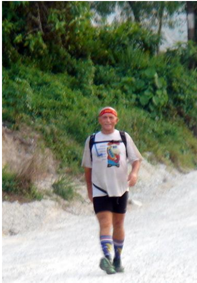
The usual FRB!