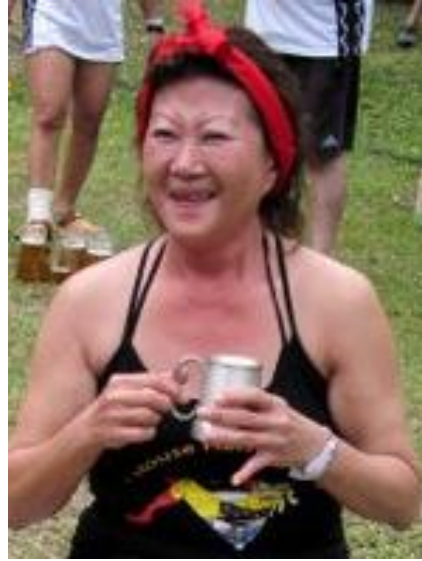
Bendover and Beauty Queen