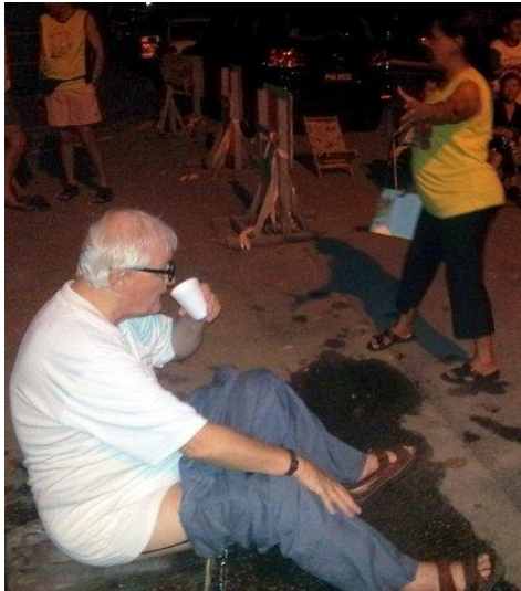
Hare on ice. Monty shows how it's done!