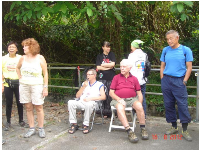
Tension building... no GM!