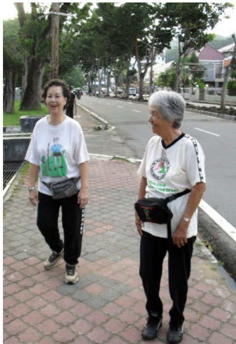
More pack leaders