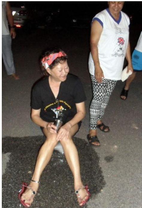
Beauty Queen on ice, for those hash shoes