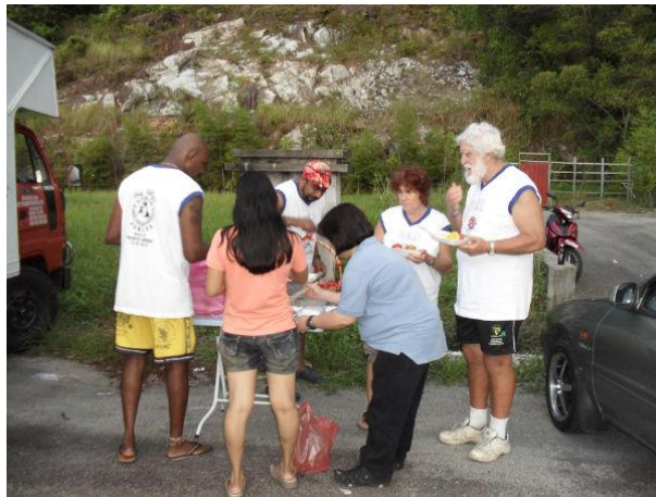
Guests and members enjoyed the food...