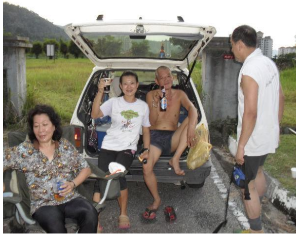
Then the party began