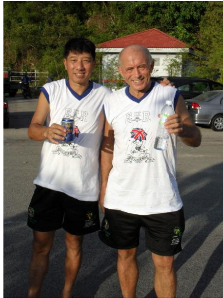
The Contractors ... thanks guys!