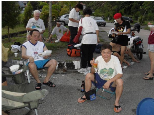
...or a drink and a smoke!