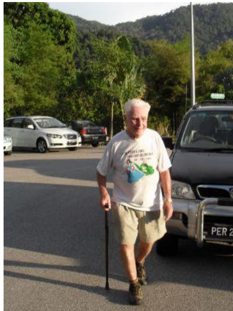
The first runner back... again!