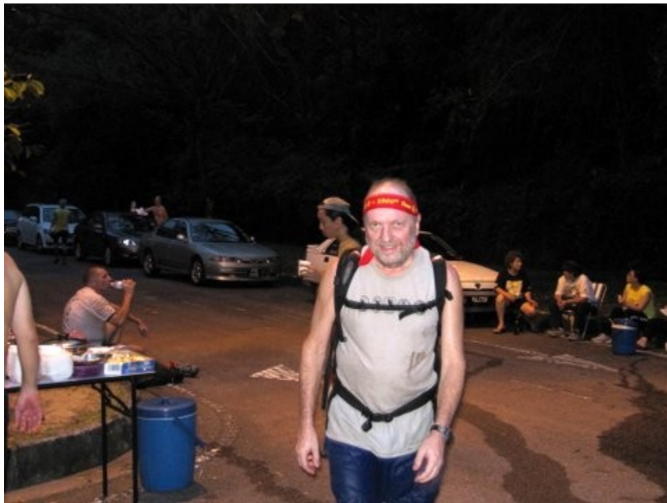
Viking's boat was a bit delayed returning!