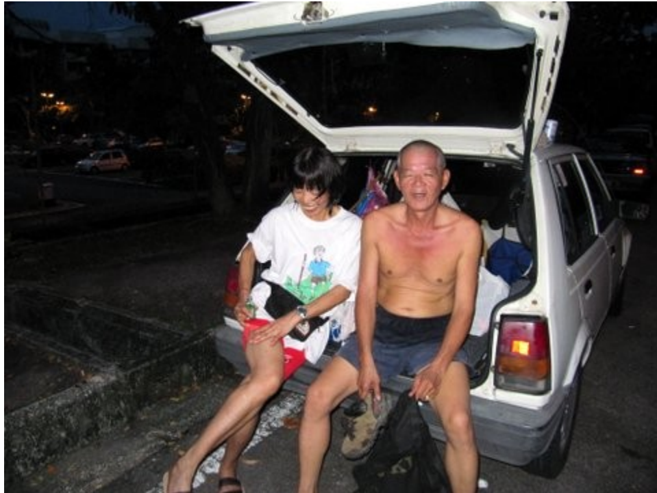
Pussycat showing a bit of leg!! It's too much for Take Care!