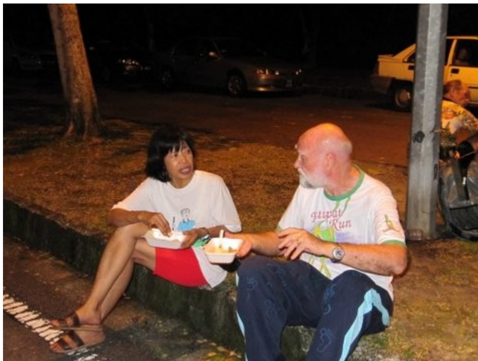
Huge regaling his intrepid adventure!