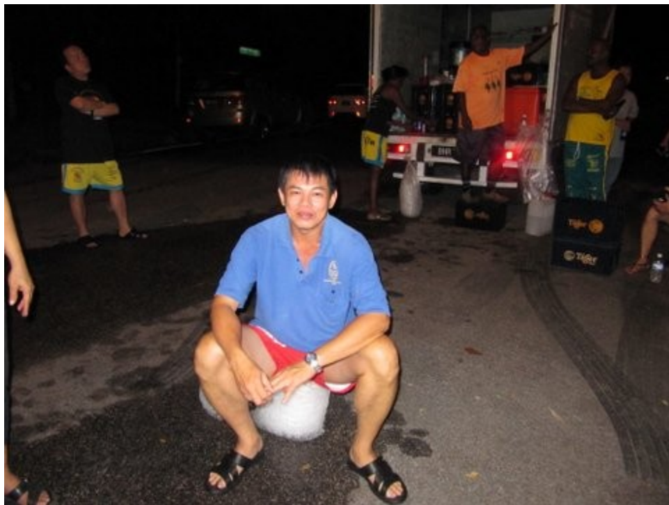
Many thanks Silent Man