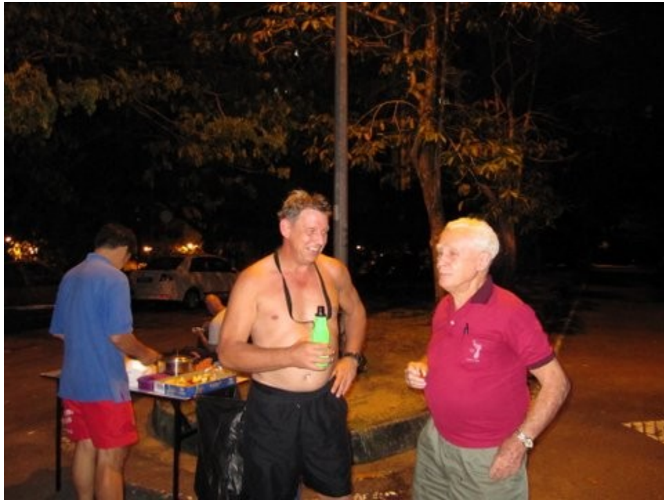
Our elder Statesman – Snow White - still in fine form