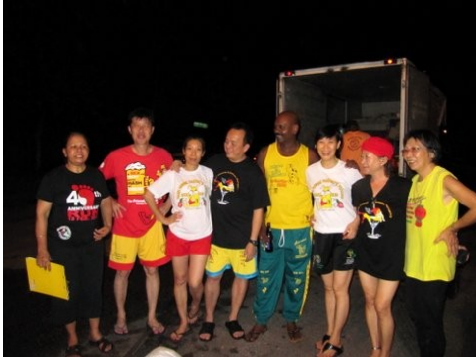
The heads of the G8 Summit