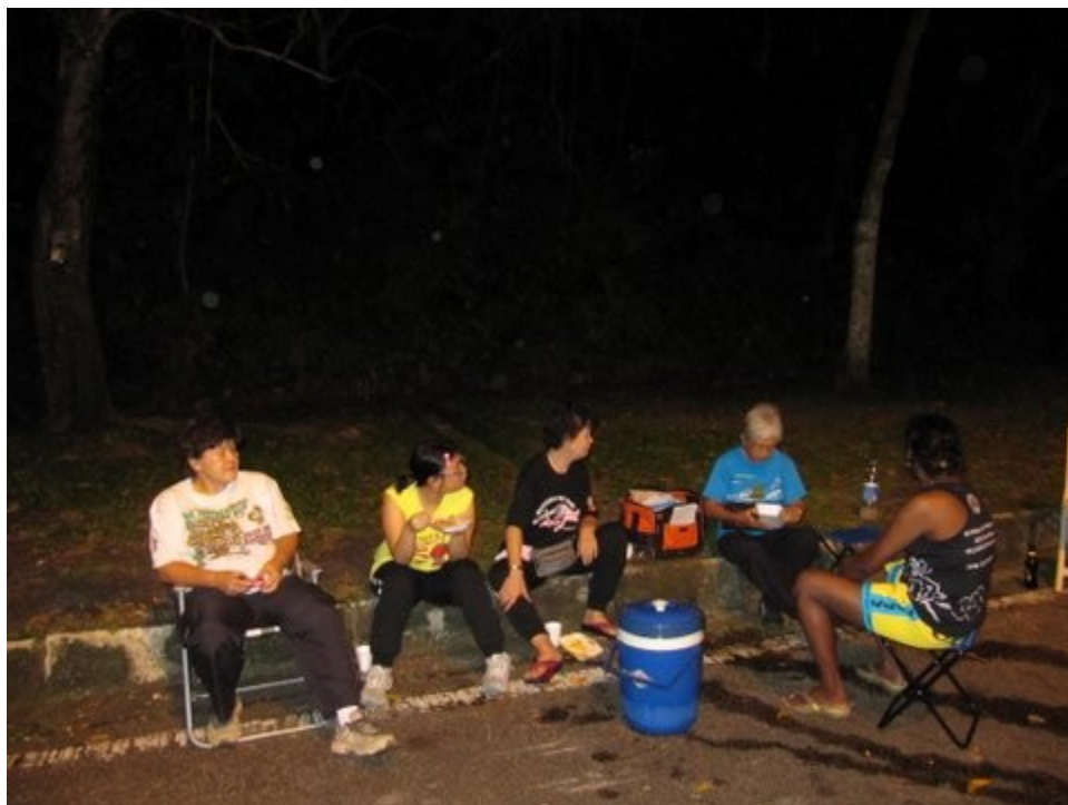
The Women's Knitting Circle??