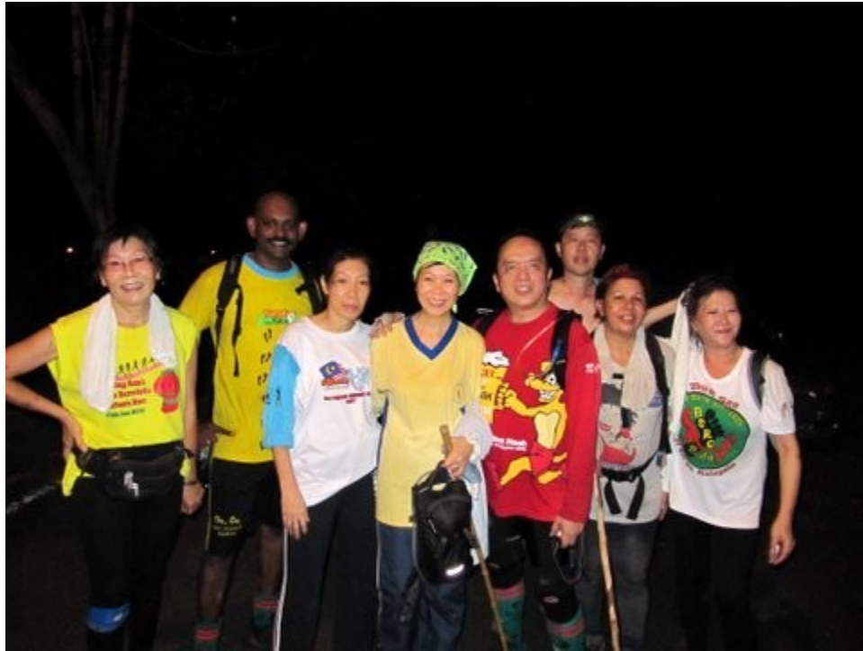
The Happy Returning G8