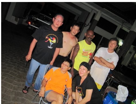
A few of the usual suspects, ...already a bit senget!