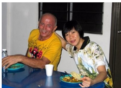
A nice portrait of a nice couple.