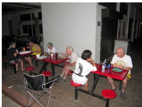
Bee Gallery is such a civilised runsite.