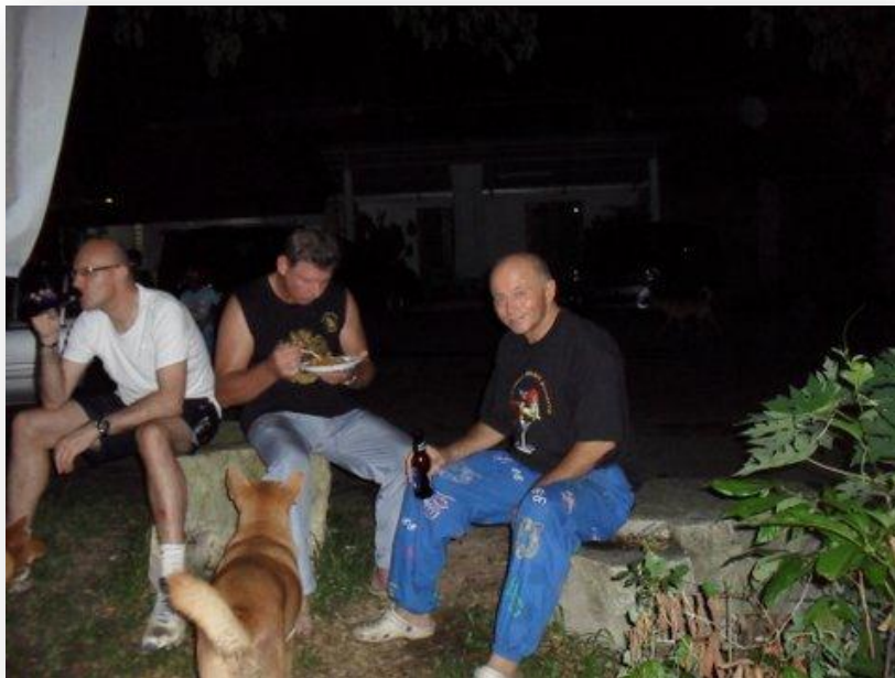
Hey! Give me some food please.