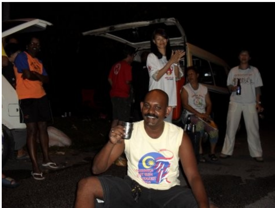
The GM put Grasshopper on ice to find out how he was, since he has not been able to run recently due to injury