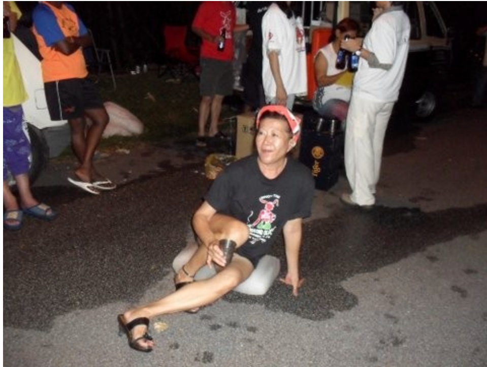
Beauty Queen was caught trying to escape before the circle was over and hence was iced for disrespect.